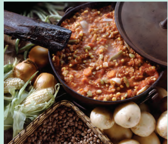
Newly freed slaves introduced their unique culinary style to the masses

Although former slaves were now free, some still lacked resources and lived in poverty for many years, continuing the “use what you have” approach. Many of the available jobs were in restaurants cooking for others, so their unique culinary style was now available to the masses.