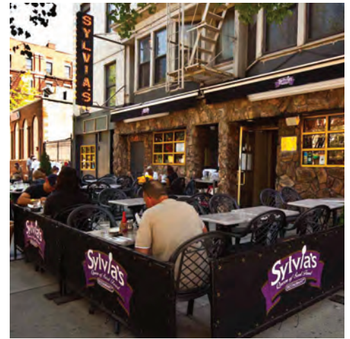
Opened in 1962 in Harlem, NY, Sylvia's is one of the first soul food restaurants.

During the Civil Rights Movement of the 1960s, soul food began to be seen as a source of pride and cultural/familial bonding. This is when the term “soul food” (along with terms like “soul sister” and “soul music”) became a part of American vernacular as African Americans claimed their stake in the American cultural landscape. More freedoms were sought and gained, and African American culture was celebrated more freely. The first soul food restaurants also opened in this decade, further establishing the newfound popularity of this unique cuisine. One example is Sylvia’s, opened by Sylvia Woods in Harlem in 1962. Still in operation today, Sylvia’s has expanded to include a catering hall and a line of grocery products, and its founder is widely known as “The Queen of Soul Food.”