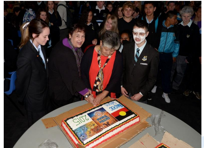
Tamworth High School is an inclusive centre of innovation, creativity and excellence