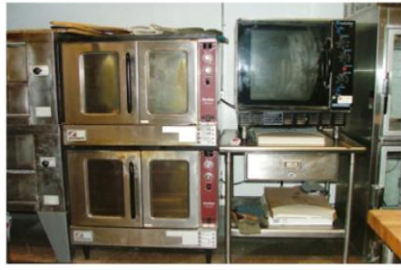
Southbend and Moffitt Convection Ovens