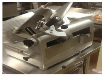
Hobart Meat Slicer