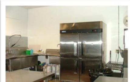
TurboAir 4 Door Refrigerator