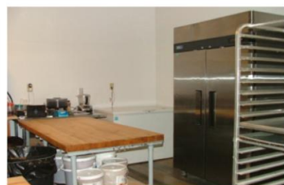
TurboAir 2 Door Freezer