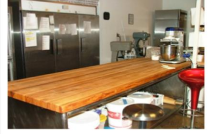
3 Door Refrigerator and Vollrath Mixer