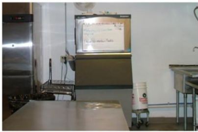
Scottsman Ice Machine