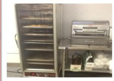
Warmer and Bread Slicer