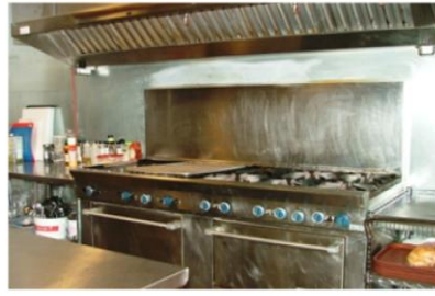
6 Burner Stove with 3 Burner Grill