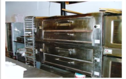
Bakers Pride Stone Pizza Ovens