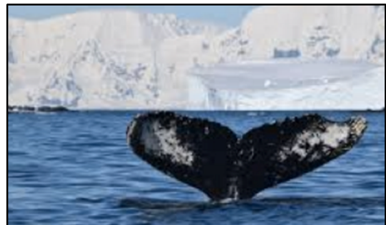
The patterns on a humpback whale's fluke are as distinct as the human fingerprint and can be used to identify individuals.