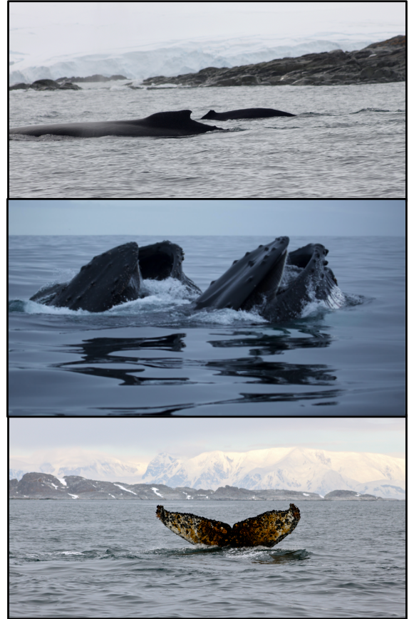
Images of humpback whales at the Palmer Station LTER in the Western Arctic Peninsula.

One geographic area that was over-exploited during times of high whaling was the South Shetland Islands along the Western Antarctic Peninsula (WAP). The WAP is in the southern hemisphere in Antarctica. Humpback whales migrate every year from the equator towards the south pole. In summer they travel 25,000 km (16,000 miles) south to WAP's nutrient-rich polar waters to feed, before traveling back to the equator in the winter to breed or give birth. Today the WAP is experiencing one of the fastest rates of regional climate change with an increase in average temperatures of 6° C (10.8° F) since 1950. Loss of sea ice has been documented in recent years, along with reduced numbers of krill along the WAP.