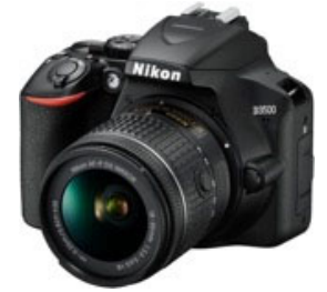
NIKON DSLR CAMERAS