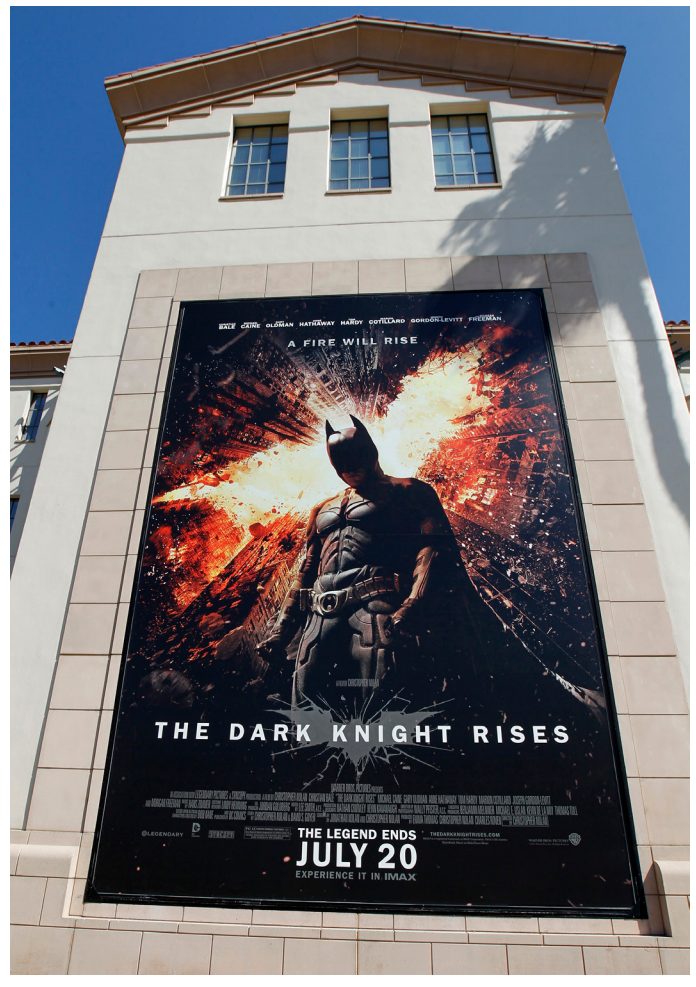
A software company said the unauthorized use of its trademark "Clean Slate" in the Batman film 'The Dark Kniaht Rises'' and on two websites advertisina the movie constituted trademark infringement and unfair competition.

The 7th Circuit agreed, reasoning that a superhero movie and a desktop management software program are different products in the minds of consumers.