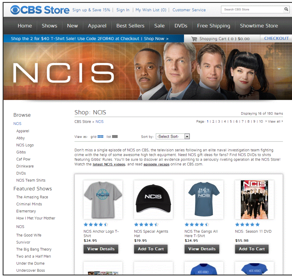
The suit says CBS sold the infringing puppet on its online store for the "NCIS" show, shown here.

In response to Delivery Agent's request, Folkmanis created a smaller soft sculpture