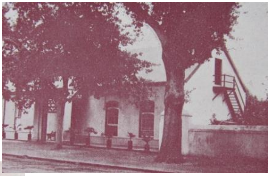
FIRST GYMNASIUM, DORP ST