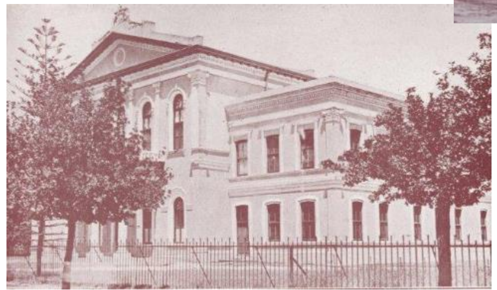
OU HOOFGEBOU, 1886