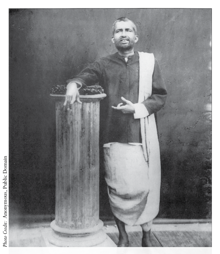
Sri Ramakrishna, Studio of Bengal Photographers (December 10, 1881)

What is a renaissance? Literally, it means a rebirth. But there is more to it. "A Renaissance is not only a rebirth but a purification as well. A Renaissance involves a sorting out process in which the old is purged of its dross or its impurities so that only that which is the best is carried over to make up the new." The 'newness' is an essential aspect