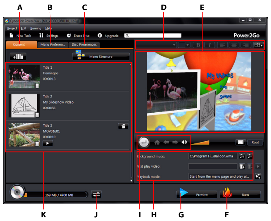
A - Disc Content Tab, B - Menu Preferences Tab, C- Disc Preferences Tab, D -Disc Menu Font Properties, E -Disc Menu Preview Window, F - Burn to Disc, G - Preview Disc Menu, H- Disc Menu Properties, I - Menu Navigation Controls, J - Toggle Display, K - Disc Content

When you select the Video CD (VCD) Disc or DVD-Video Disc option in the new task window, the create disc window displays as follows: