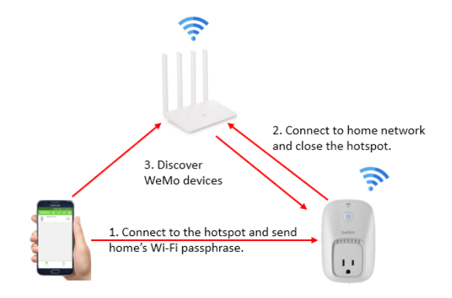
Fig. 1. Initial configuration of a WeMo device: (1) user connects to a hotspot spawned by the smart device, and transmits home network credentials; (2) device connects to home network and switches off hotspot; (3) user discovers and connects to WeMo device using mobile app.

<sup>1</sup>OpenWrt - Wireless Freedom, https://openwrt.org/