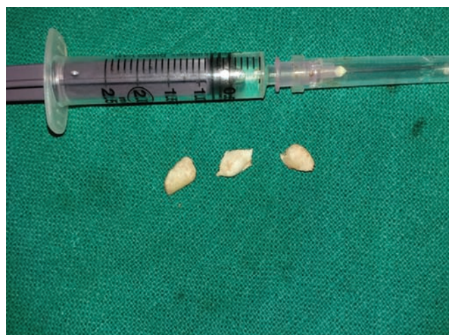
Fig. 5: Excised specimen