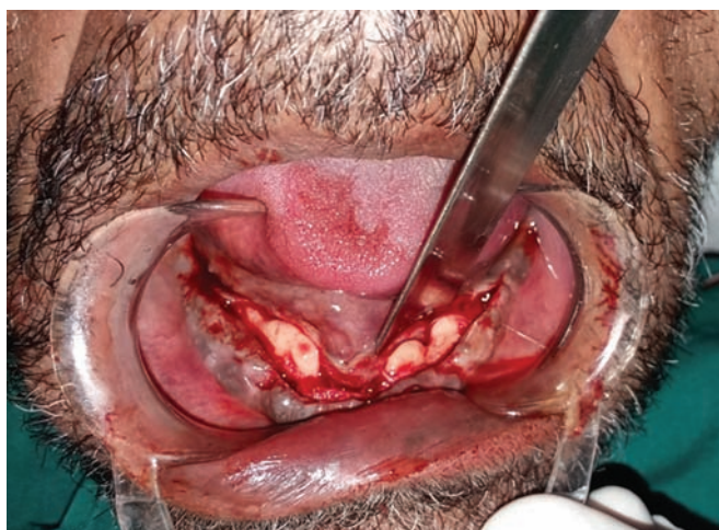
Fig. 2: Exposure of the toris bilaterally