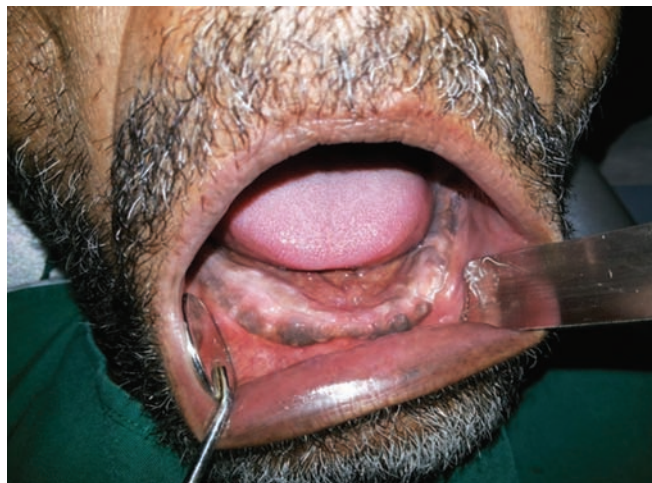
Fig. 8: Postoperative healing after 1 month

Surgical excision of torus is one of the routinely performed minor surgical procedures. Precautions pertaining to flap reflection, excision, and closure usually avoid most of the postoperative complications. In the current case, surgical resection of the bilateral, multiple nodular mandibular torus with the combination of surgical burs