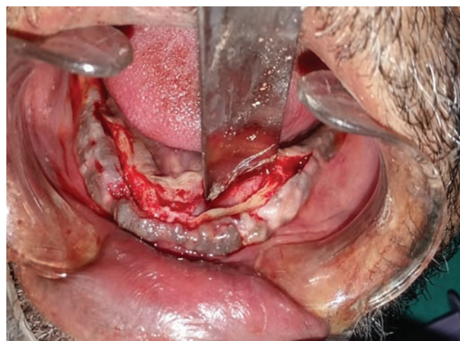
Fig. 3: Surgical view after excision of the toris bilaterally

excision of the mandibular torus. Bilateral inferior alveolar nerve block with local infiltration (2% lignocaine hydrochloride with adrenaline 1:80,000) was administered. A crestal incision was placed at the center of the alveolar ridge extending from the first molar region of right side to the left side. Full-thickness mucoperiosteal flaps were raised, taking care that the thin flaps do not lacerate or tear, and the tori were exposed lingually (Fig. 2).