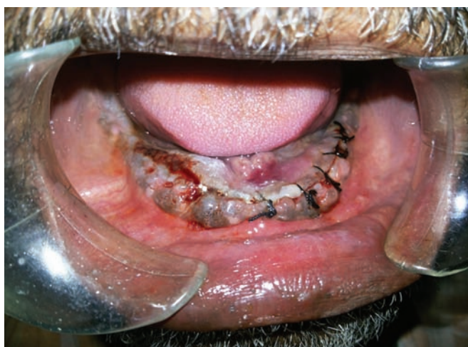
Fig. 4: Closure of the wound with 3-0 silk sutures on left side and cyanoacrylate glue on the right side

Postoperative instructions regarding wound care, diet, maintenance of good oral hygiene, and medications (antibiotics and analgesics) were given to the patient. The excised specimen was sent in 10% formalin for histopathological examination (Fig. 5). Hematoxylin and eosin staining of the specimen revealed nodular masses of dense cortical bone organized in a lamellar pattern with an associated fatty marrow tissue at the inner zone of trabecular bone (Fig. 6).