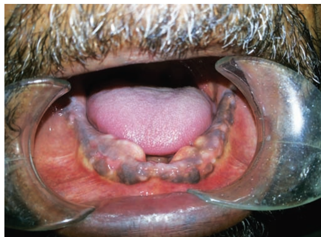
Fig. 1: Mandibular tori in the bilateral premolar region

After radiographic evaluation and routine hematological investigations, patients consent was taken for surgical