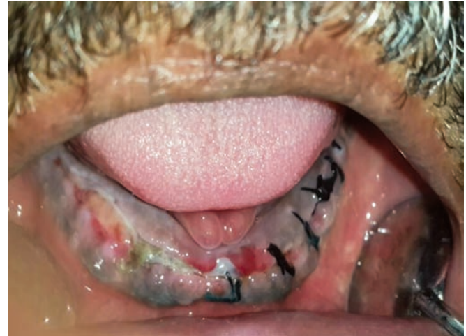
Fig. 7: Postoperative healing after 1 week

Evaluation of the wound was done on 1st and 3rd postoperative days and sutures were removed on the 7th postoperative day (Fig. 7). The long-term follow-up revealed excellent postoperative healing of the glued side with no pain or erythema, compared to the sutured side. The patient was referred for fabrication of the missing teeth (Fig. 8).