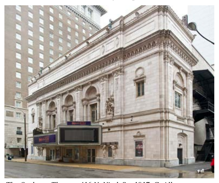
The Orpheum Theater, 416 N. Ninth St., 1917, G. Albert Lansburgh

Rendered in the Beaux Arts style, the three story steel and concrete building extends 110 feet on Ninth Street and 125 feet on St. Charles. Both the north and east sides of the building have alley access, making possible egress from all sides of the theater. Clothed in cream colored terra cotta, the theater front has three parts. In the large center area, the marquee shades the three main street entrances. Above the marquee, three arched recesses are framed by neo-classical decoration, with French doors opening onto small balconies. Sculpted figures are set in niches on either side. A bracketed cornice supports the attic level, which has the theater's original name inscribed in terra cotta. A single story arcaded portico with balcony above extends along St. Charles for most of the building's depth.