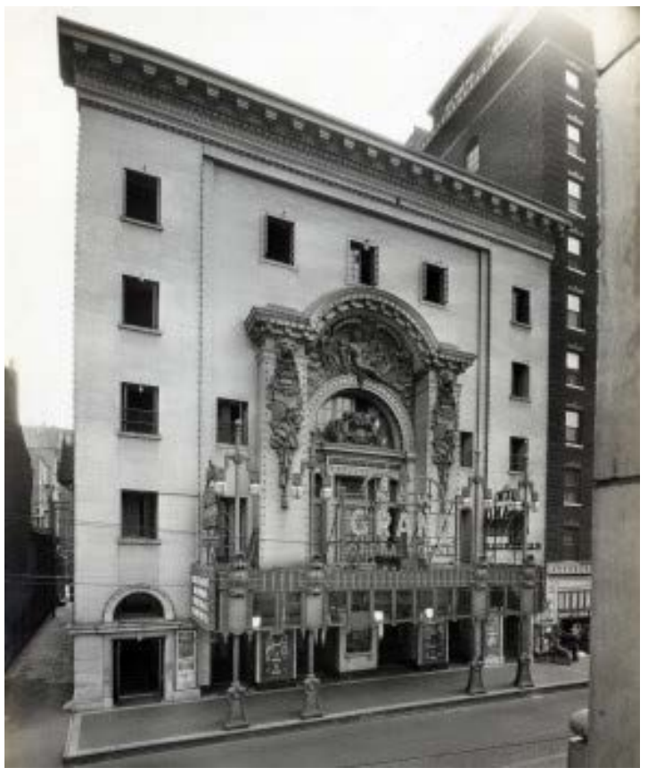
Grand Theater, 512-514 Market St., 1912-13, Tom P. Barnett, built on the site of the old Varieties Theater, see Vol. XX, No 2B, p. 3.

length and projecting it in a building specifically designed for this purpose. Once separated from other forms of entertainment, movies found accommodations ranging from tents and air domes (a euphemism for outdoor theaters) operated only during the summer, to nickelodeons, and culminating in neighborhood or community theaters. While the nickelodeon offered twenty-minute programs in a converted storefront with very few personal comforts, neighborhood theaters presented full-length feature films in surroundings closely resembling theaters for live performance. These movie houses had fireproof construction, ample egress, comfortable seating, restrooms, good sight lines, and snack food. During this period, the scale of these arrangements tended to remain modest in comparison to the largest legitimate theaters.