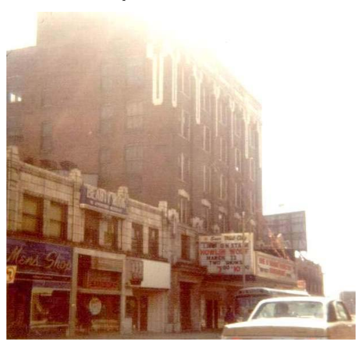
Princess Theater, later the Rialto, 320 N. Grand, 1910, Clymer & Drischler

access in the center, and a restaurant admission on the south end. A bronze marquee sheltered the theater access.