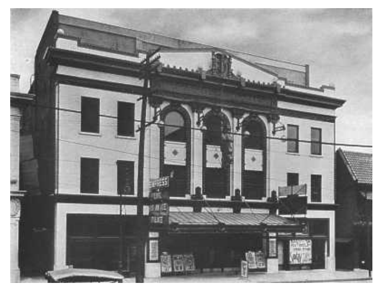
Empress Theater, 3620 Olive, 1912-13, Clymer & Drischler

star power. To attract large audiences, they offered high class productions at reasonable ticket prices. Unfortunately their experiment failed. Rising production costs and low audience participation resulted in a loss of $200,000 during its four seasons of operation. Increasing debt forced the Empress to close on March 19, 1955. Except for a brief period as a church, it remained closed until its demolition in March 1977.