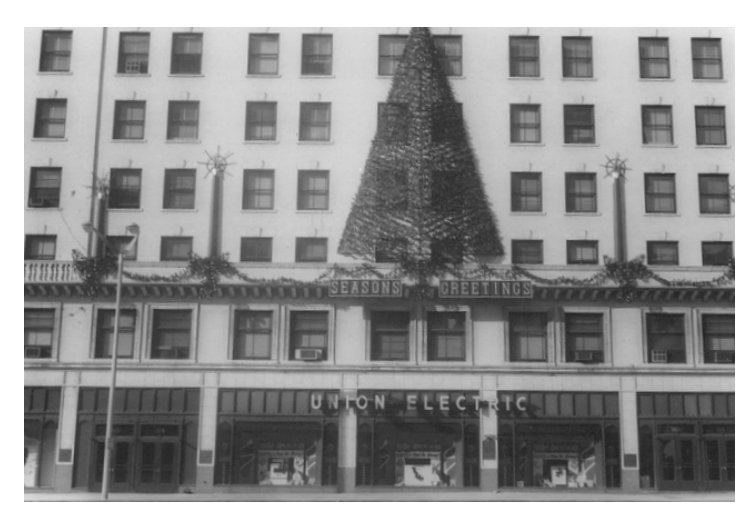
The Twelfth Street (Tucker Blvd) front of the Shubert Building in the 1950s, after the building had been enlarged for Union Electric and the Shubert Theater removed.

and fourteen boxes gave the auditorium a seating capacity of 1800 people. The auditorium had 16 exits. Under the large stage (76 feet wide by 50 feet deep) were sixteen dressing rooms. A direct heating system required fresh air be cleaned, heated, and circulated. While each floor of the theater had facilities for men and women, the men's smoking lounge and the ladies' retiring area were on the first floor.