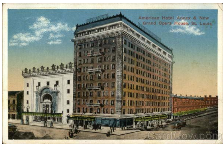
American Hotel Annex, 8 South 6<sup>th</sup>, and new Grand Opera House, 512-514 Market Street, from a postcard.

bronze marquee 36 feet long by 8 feet wide. Four pillars in the form of candelabra supported the front of the marquee. On the top of the marquee four bronze figures symbolized Thespis, Goddess of the Theater. Sculptor Victor Holm executed all statues on the front of the theater. Electric lights illuminated the marquee and outlined the central area of the front façade.