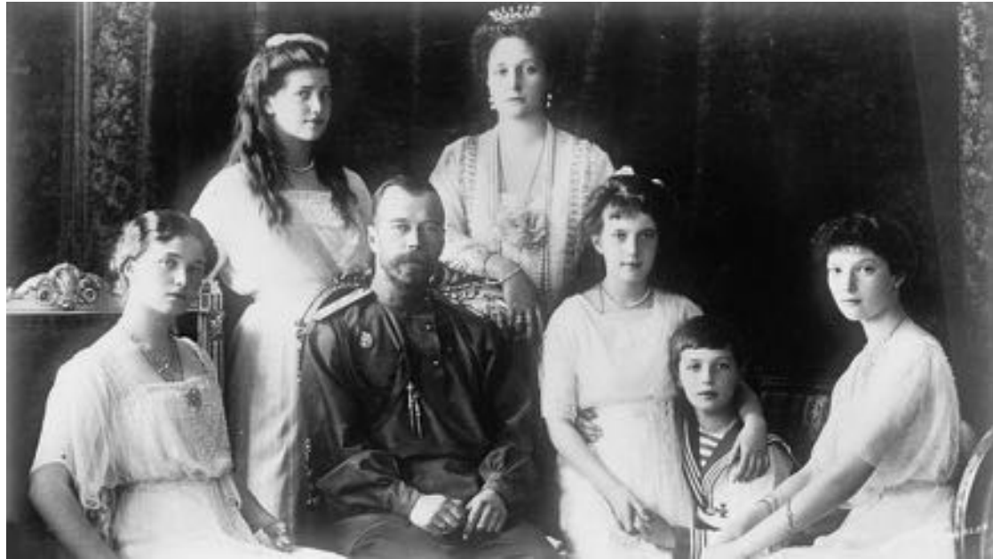
The Romanov Family

How did Tsar Nicholas deal with his enemies?