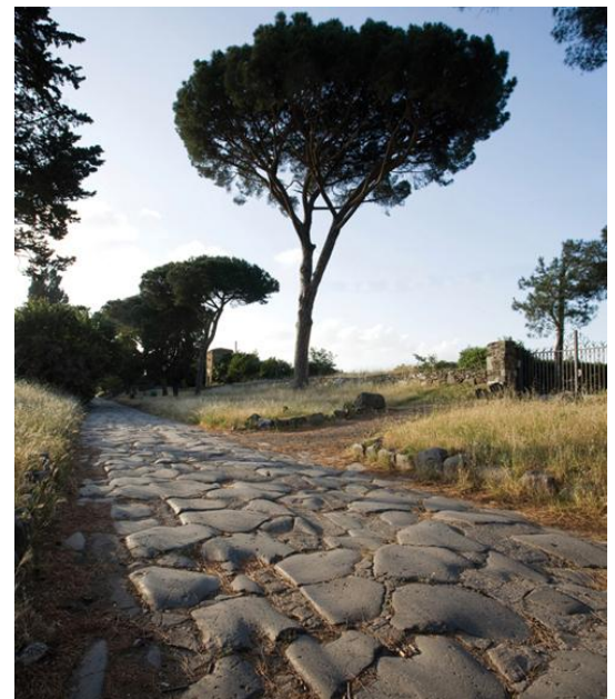
The oldest of ancient Rome’s great roads, the Appian Way, ran from Rome to southern Italy.

In this chapter, you will discover how and why the Roman Empire fell. Then you will learn how Rome’s influence lives on in so many ways today—in art, architecture and engineering, language and writing, and philosophy, law, and citizenship.