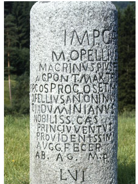
Romans wrote in all capital letters, as seen on this Roman distance marker from 217 C.E.

Finally, we still use Roman numerals. The Romans used a system of letters to write numbers. In the Roman numeral system, the letters I, V, X, L, C, D, and M represent 1, 5, 10, 50, 100, 500, and 1,000. You may have seen Roman numerals used on clocks, sundials, and the first pages of books. You might also spot Roman numerals on buildings and in some movie and television credits to show the year in which they were made.