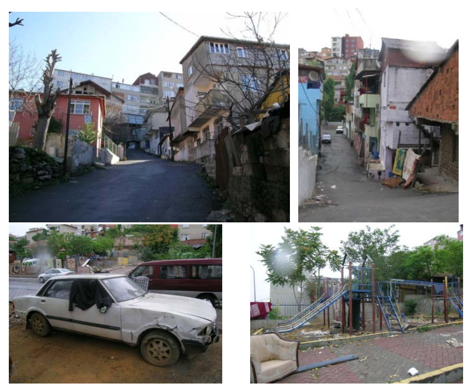
Figure 3: Poverty environments in Yeni Sahra Squatter settlement

The environment reflects the economic weakness. Especially the new comers live in worse conditions. The neglected places in the West where mostly Romans live seem to be the worst part. At this region some people even live in old, broken cars (Figure 3).