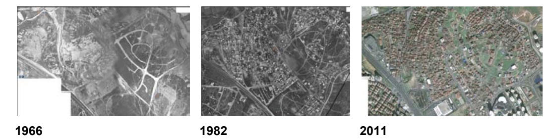
Figure 2. Transformation of Yeni Sahra Square Settlement.

In the first years, squatter areas were politicized. They were influenced from the atmosphere of socio-political contradictions in Turkey based on unemployment-poverty and political oppressions in great scale. The inhabitants of Yeni Sahra were mostly of pro rightist-conservative ideologies, whereas the people living in the adjacent squatter neighborhood, 1 Mayis (named in relation to 1st May, Worker's Day) were under the influence of leftists and Marxist thoughts. Ironically, in the 1970s, people called Yeni Sahra as "Demirel Neighborhood", in referring to the leader of a liberal party and former prime minister (1965-71, 1975-78, 1979-80, 1991-93) and "1 Mayis" as "Ecevit Neighborhood", in the name of the leader of a social democrat party and former prime minister (January-November 1974, June-July 1977, 1978-79, 1999-2002) (Ozdemir, 2008).