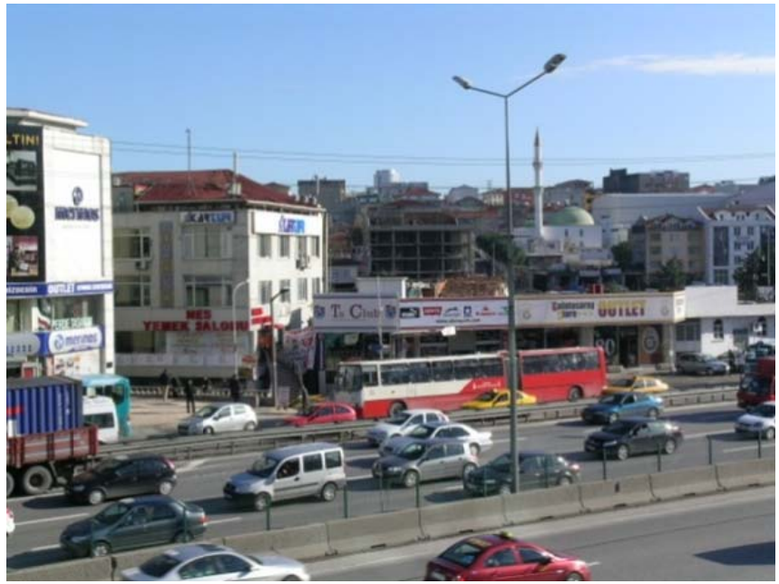
Figure 1. Outlet stores along the Highway, E5

The research in Yeni Sahra was held in different phases. Firstly, the mayor (muhtar) of the neighborhood was interviewed, who migrated from Trabzona city in the Northeast region, in 1969 when he was five years old and settled in the site. His family belongs to the pioneering group that built the first informal houses. Secondly, the records of randomly chosen 58 household leaders, their ages, original cities, the duration of inhabiting and household sizes were enlisted by the help of the mayor's archive. Thirdly, visited squatter houses were measured and photographed in order to draw the plan schemes. Their inhabitants were interviewed in detail to understand both their social status and their relation with the houses and the settlement. Lastly, the news articles about Yeni Sahra, published in a local newspaper (Milliyet Gazetesi) in the period of 1978- 2010, were examined.