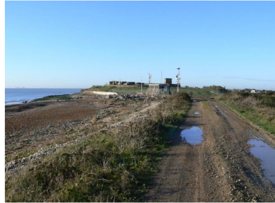
The Dymchurch Redoubt is at the far end of the ranges.