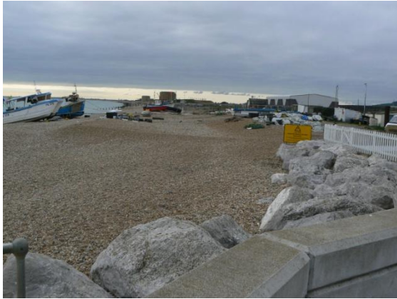
This short stretch of shingle beach leads to Martello Towers which mark the beginning of Hythe Ranges.