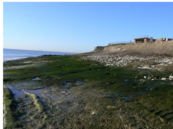
Here the exit is confusing as the path leads to locked gates. The only way out is across a slippery sloping apron on the seaward side of the Redoubt leading to a concrete ramp. This would not be possible at high tide.