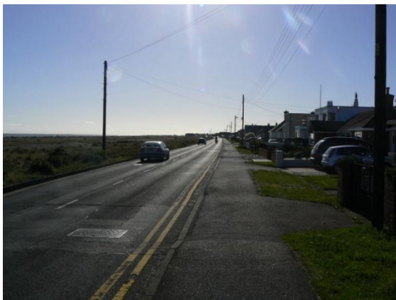
From Greatstone to The Pilot is a very wide shingle beach which is hard walking and it is easier to continue along the road though it is well back from the sea. The road turns inland at The Pilot.