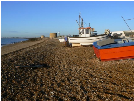
These ranges are busy and it is only possible to walk along the coast when firing is not taking place (on this case a Sunday). There is an easy clamber over a few rocks to a broad shingle track along the top of the sea defences.