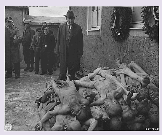
Buchenwald Concentration Camp