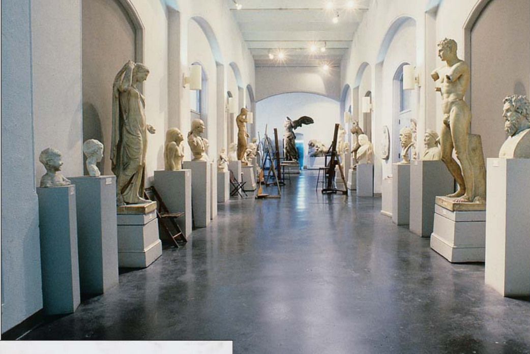
Fig. 13: The cast corridor at the Pennsylvania Academy of the Fine Arts, ca. 1990.