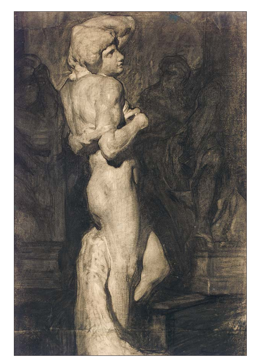
Fig. 9 : Julius T. Bloch (1888–1966), drawing of a cast of two goddesses from the Parthenon, 1912. Graphite, size unknown. Reproduced in the PAFA school catalogue of 1912–13, p. 22.

Fig. 8: Daniel Garber (1880–1958), drawing of a cast of Michelangelo's Dying Slave , ca. 1900. Charcoal, 255/_{16} \times 19 inches. Gift of the artist, 1945.14.7.