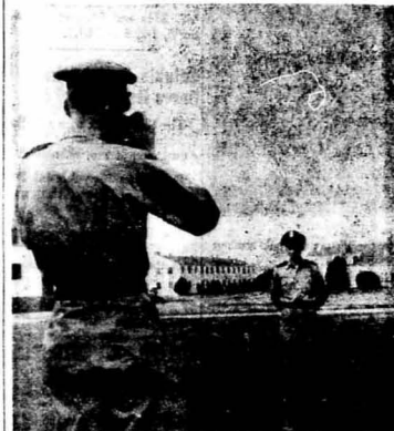
Everyone seemed to lug along a camera to record the events of the three-day trip to air force bases in Texas. Two cadets snap and get snapped at Randolph Field.

21 Take Flower Judge Exams Twenty-one women took the final exam for amateur flower show judges at the fifth Southern Illinois Flower Show School Friday at the University School Auditorium. The exam was based on color review, flower arrangement, landscape design and horticulture. Contestants will be notified of exam results in two weeks.