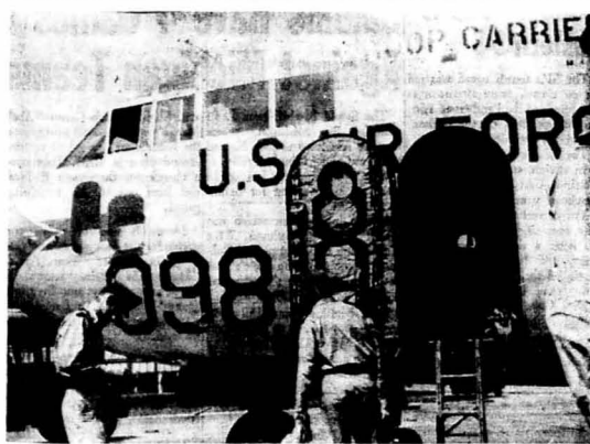
AFROTC cadets board their plane at Scott Air Force Base for the beginning of a three-day trip which took them to Randolph, Kelly, Lackland and Brooks Air Force Bases in the San Antonio, Texas, area.