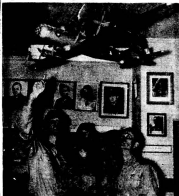
A group of interested cadets look over models on display in the museum at Randolph Air Force Base.