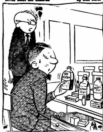
"Oh, it's your desk—th' former teacher didn't take time to empty his desk."