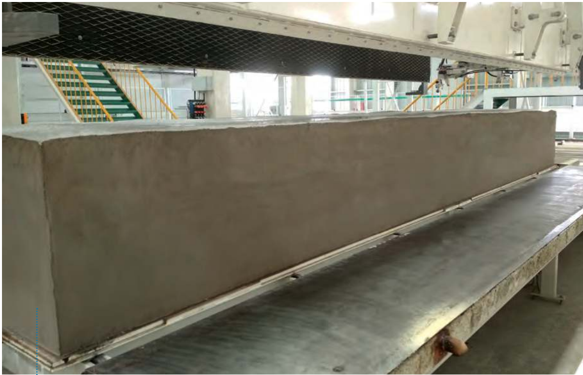
Fig. 7: In all Aircrete plants, the four side plates of the moulds fold down as a standard practice