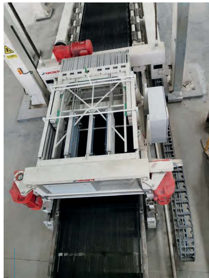
Fig. 10: A top view of the pusher and the cross-cutter of the Aircrete Cutting Line on site

The heart of the factory, the cutting line, is of course based on the Aircrete Cutting Line, as the main objective of the customer was to start producing panels. As the Aircrete Cutting Line is designed in order to offer the least possible number of steps of handling a cake during the green stage (i.e. this is the stage before the autoclaving when the cake is still quite vulnerable), it can be considered as optimal technology for making AAC panels. Once the green cake