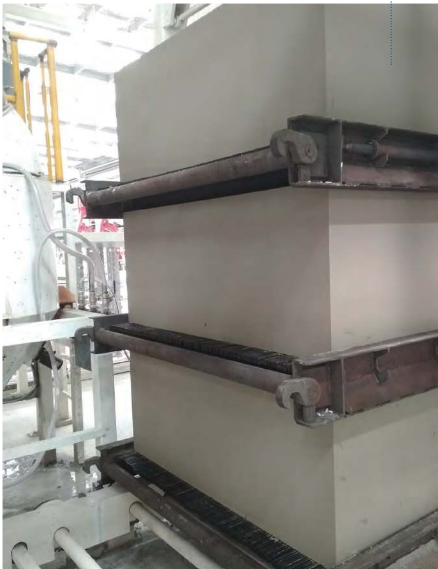
Fig. 13: The cakes on the curing frames are being stacked to three levels high