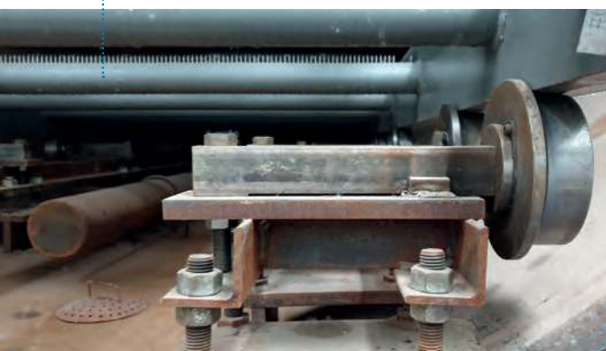
Fig. 14: A close-up view of the autoclave rollers with special bearings

For this factory in Luoyang, it was chosen to profile AAC products in the green stage (both top and bottom profiling) on the cutting area (Fig. 12). Bottom profiling occurs under the grabbing crane when the product is lifted from the mould. In this plant, Aircrete Europe supplied its new semi-dynamic top profiling with retractable knives in addition to the standard static profiling. This allows to make a combination of panels with profiling and rest-blocks without profiling in one cake. Although profiling in green is a fast and efficient way to profile products that easily meet highest European accuracy standards, Aircrete Europe also offers the possibility to integrated full pack-profiling in the white stage (i.e. after autoclaving) in its factories. Although the investment in this is slightly more expensive than profiling in green, the levels of accuracy and profile quality that can be obtained here are even higher.