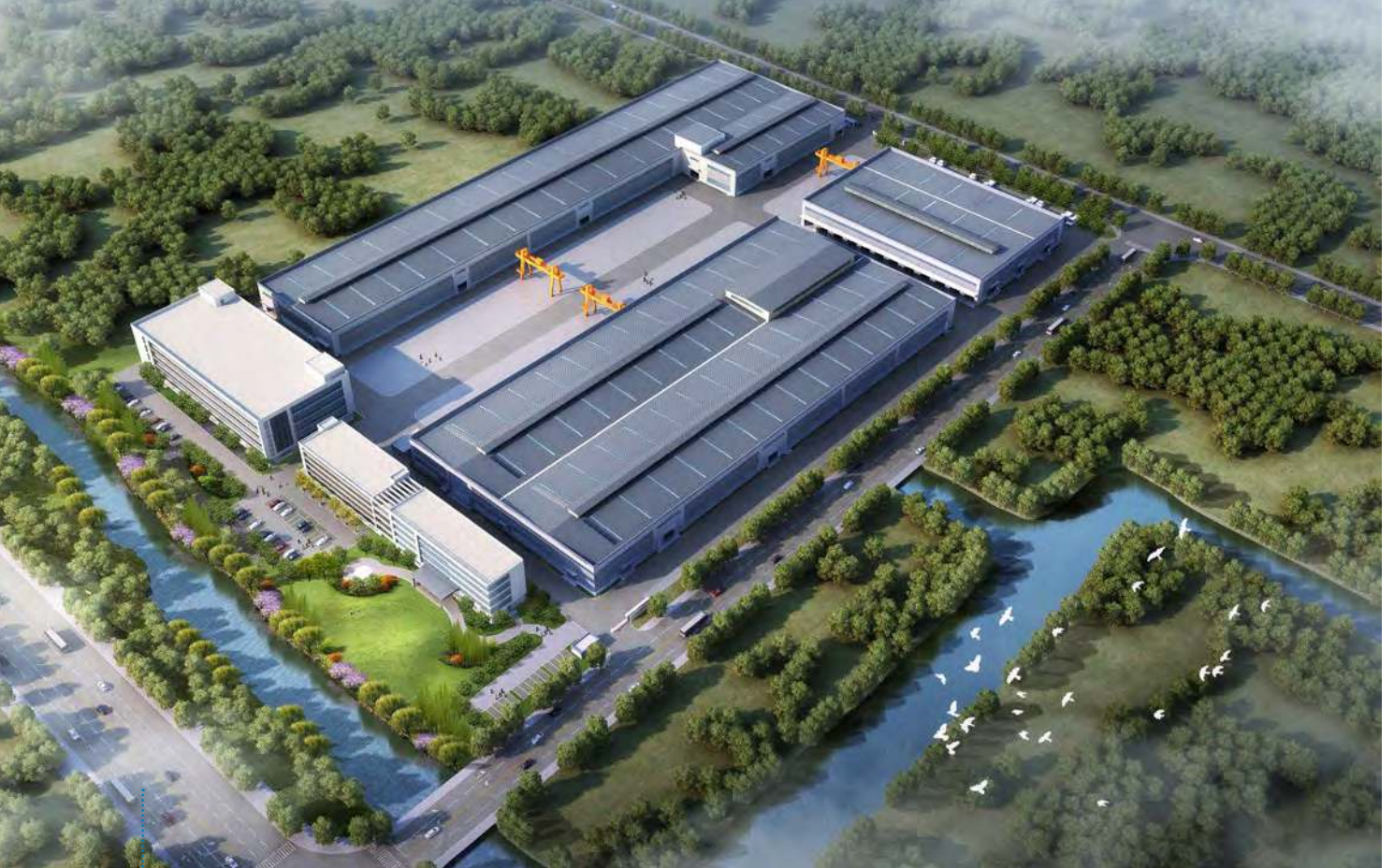
Fig. 15: The new plant in Shaoxing will be a modern and automated AAC panel plant in China

After cutting, the curing frames on which the cakes are laying, are stacked with a stacker to three levels high (Fig. 13). With a designated traverser (that can be operated in fully automated mode) the 3-high stacked frames are then pushed into the autoclaves. Autoclaves in Aircrete factories are equipped with rollers with special maintenance-free bearings, reducing the need for autoclave trolleys, also eliminating the requirement of the autoclave trolley circulation (Fig. 14). A major advantage of this system without separate autoclave trolleys in the production process is that it allows for full and easy automation of the full autoclave loading and unloading process.