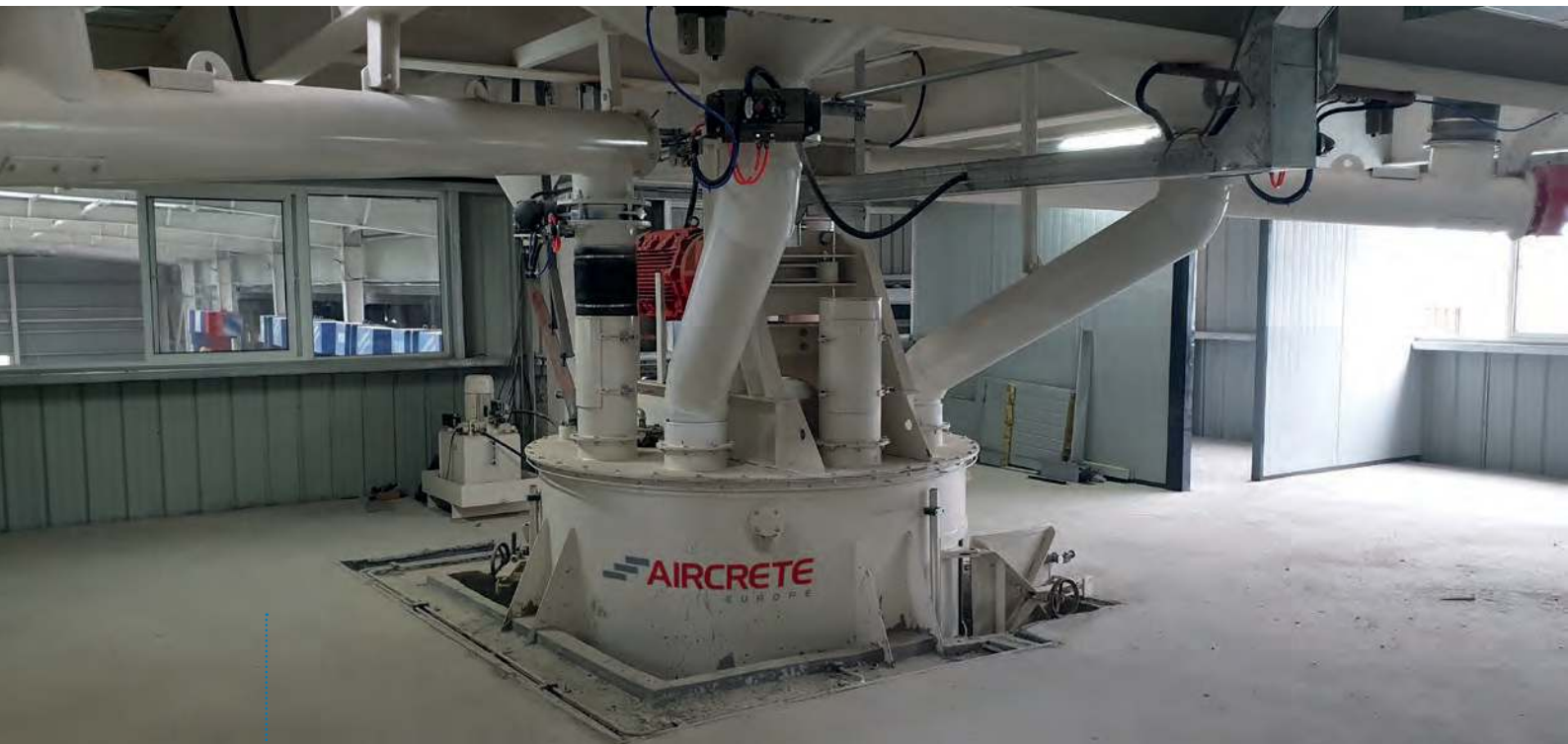
Fig. 5: The Aircrete low-speed mixer with multi paddles provides a homogeneous distribution of raw materials in the mix

plants. The accurate and reliable Aircrete dosing and mixing system uses an intelligent software control system to measure with high precision. The Aircrete low-speed mixer ensures homogeneous distribution of raw materials in the mix and through its design is especially suited for the panel production, where the cake volumes can vary considerably (Fig. 5).