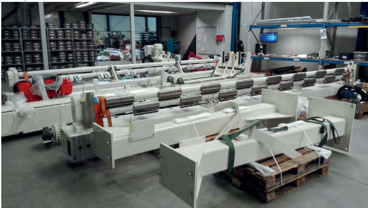
Fig. 6: The cross cutter of the Aircrete Cutting Line is ready for shipment from the Netherlands on its way to Luoyang

As for every project, an optimized sourcing strategy results in the procurement of certain, less-core items locally (e.g. boiler, slurry tanks, silos, etc.). This approach ensures that the total investment budget is economically optimized without impacting the quality or performance of the plant. Aircrete Europe assists its customers with advising on this optimal sourcing of the equipment. The core equipment (like