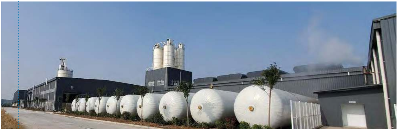
Fig. 3 and 4: The new plant of Luoyang Evergreen Building Technology is designed for a yearly capacity of 500,000 m 3 with 10 autoclaves

plant design which allows for the versatile production of large variety, high-volume and high-quality reinforced panels and traditional blocks in the most efficient manner. Such a customized approach results in transparent investment expectations and an optimal AAC plant infrastructure for the plant's specific location, eliminating negative design and budget surprises during the project.