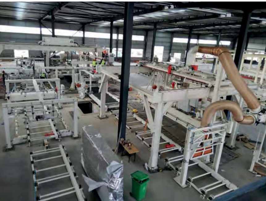
Fig. 9: In all Aircrete plants, the equipment foundations requirement is minimized to only the ball mill, mixing tower and cutting line

Besides the significant positive impact on investment budget, another advantage of very little foundations is that equipment is very easily accessed, and the factory is very easy to keep clean.