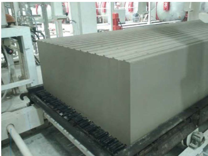
Fig. 12: Both top and bottom profiling are done in green stage