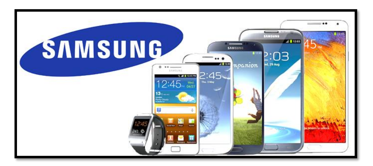
Fig 3. Samsung's mobile (web page)

"On the other hands, based on SWOT analysis, Samsung's strength is reliability. As well Samsung is known for its service and people know that Samsung gives a very fast facility for any of its product.