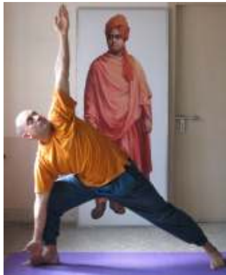
Vivekananda, the harbinger of yoga in west

This speech also gave impetus to Indian yoga and spirituality. Today, yoga is a thriving industry in the west but its seeds were laid by Swami Vivekananda in the west.