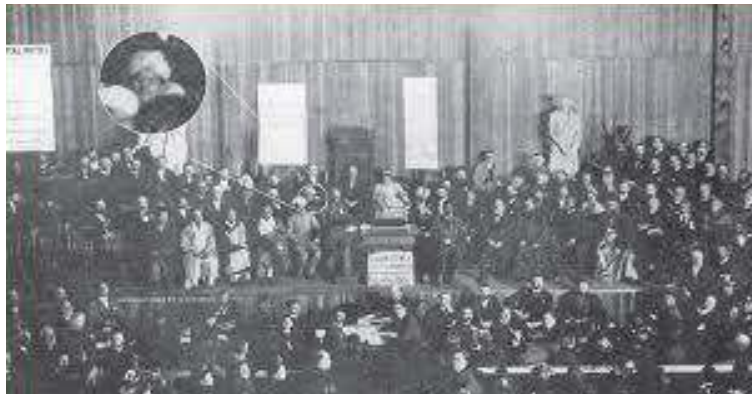
A Rare image of Swami Vivekananda at the Parliament of Religions, Chicago

This short speech recreated an interest about India in the west, in the 20 th century.