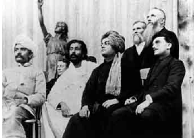
Swami Vivekananda at the Parliament of Religions, Chicago, 1893