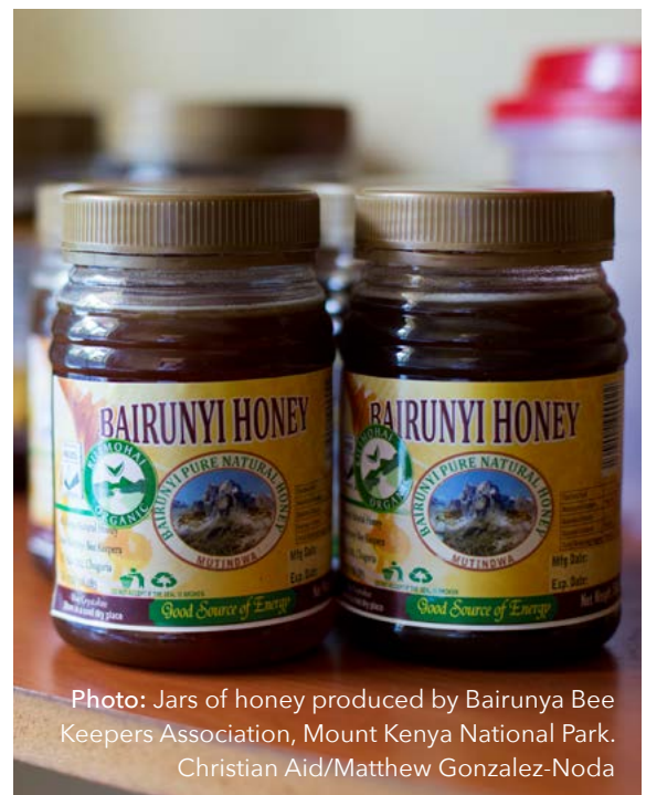
Photo: Jars of honey produced by Bairunya Bee Keepers Association, Mount Kenya National Park.

While tax rebates for SMEs can compensate them for size-specific disadvantages, they can also create ‘size traps’ that disincentivise them from growing beyond a certain threshold. Transitioning from a turnover-based tax system to a profit-based tax system will involve a higher compliance cost - and usually the hiring of an accountancy firm. However, SMEs account for only a small share of tax revenues in many countries, and the administrative cost of collecting taxes from them can be higher than the potential additional tax revenue in both turnover and profit-based accounting systems - thus a high exemption threshold should be considered on these grounds as well. Countries could also adopt a more pro-poor tax policy by reducing taxes on SMEs which, while profit-orientated, also provide goods or services to the poor, such as social enterprises (see the Philippines case study). Overall, the right balance must be found between providing an enabling environment for SMEs and the need for governments to find substantial sources of taxation. 205