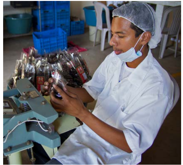
Photo: Dried hibiscus petals produced by members of the Hibiscus cooperative in Nicaragua.

While improvements in the fight against corruption help businesses of all sizes, some policy measures have particular relevance to SMEs. As DANIDA has noted, certain funds could be made available to allow SMEs to go to court and claim damages caused by corrupt practices involving public officials. In cases where SMEs suffer financial or other economic damage as a result of corruption, measures must be taken to ensure they can initiate legal proceedings against those responsible to obtain compensation. These, and other measures that assist SMEs in funding legal processes, constitute an incentive to SMEs to use existing mechanisms in the justice system. 231