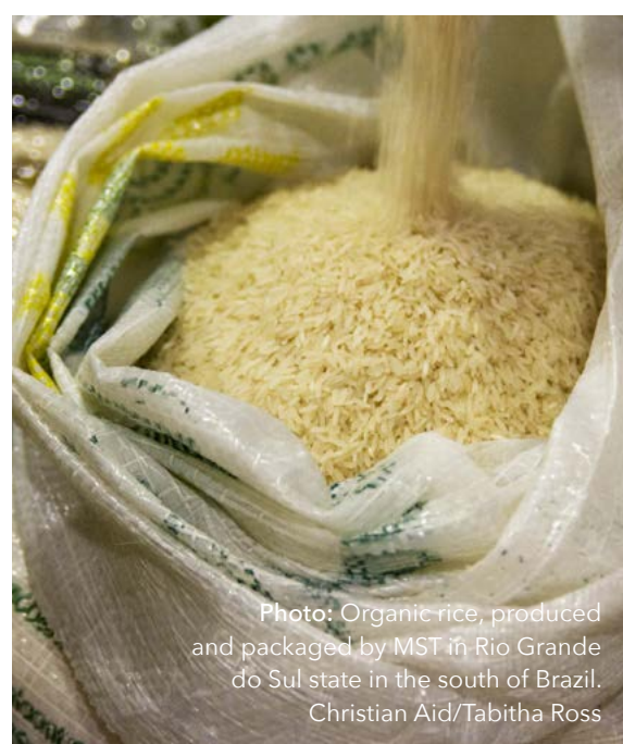
Photo: Organic rice, produced and packaged by MST in Rio Grande do Sul state in the south of Brazil.

A broad coalition in the Philippines, involving partners of ICCO, has spearheaded groundbreaking change to improve the business environment for social enterprises. The coalition, known as PRESENT (Poverty Reduction Through Social Entrepreneurship) is an alliance of around 20 networks of social enterprise practitioners, advocates, NGOs and academics which have come together to advance social entrepreneurship as an approach to poverty alleviation and economic development. Co-chaired by the Ateneo School of Government and the Foundation for a Sustainable Society (FSSI), the coalition comprises microfinance, cooperative, fairtrade, small producers and enterprises united in saying that social enterprise is a viable approach to addressing poverty sustainably.