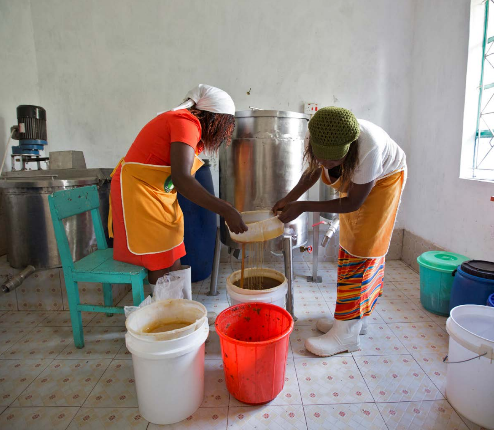
Cover photo: Workers at Soppexcca's coffee processing plant, Matagalpa, Nicaragua.