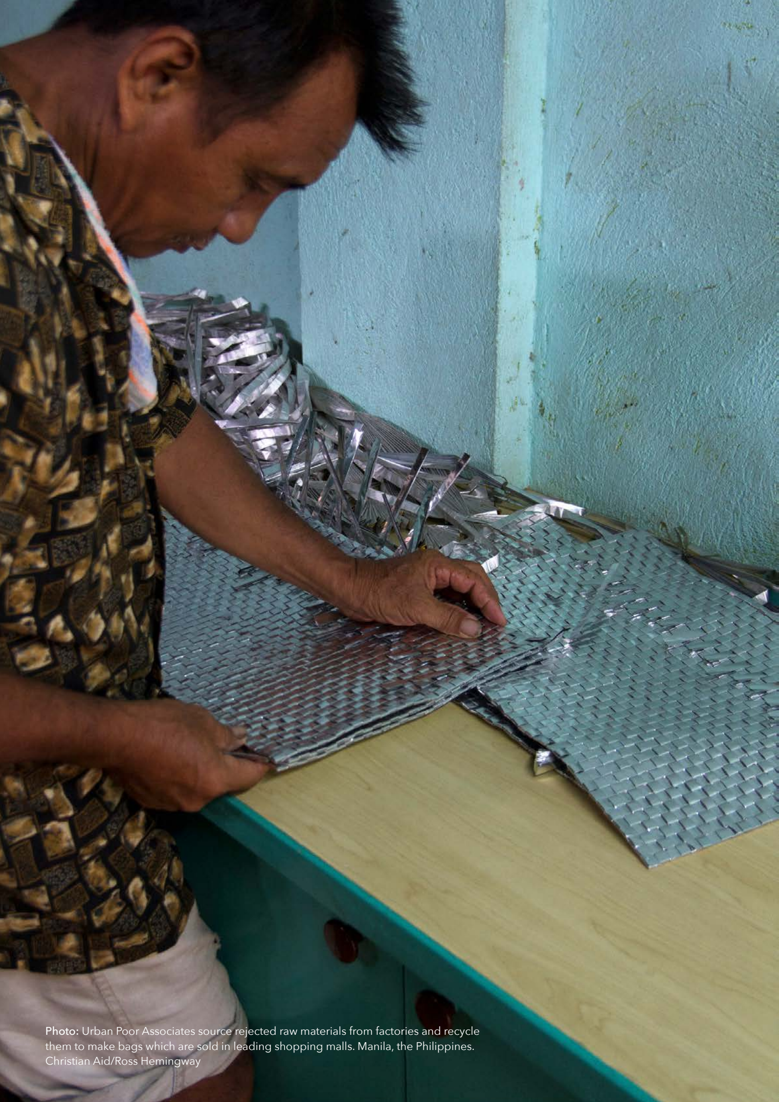
Photo: Urban Poor Associates source rejected raw materials from factories and recycle them to make bags which are sold in leading shopping malls. Manila, the Philippines.