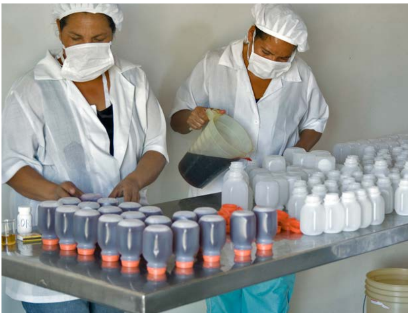
Photo: Workers at Nochari's processing plant, Nicaragua, pour 'flor de jamaica' (hibiscus juice) into bottles.

It is important to highlight that most SMEs operate informally . The ILO notes that only 9% of SMEs globally are formal. India, one of the few countries with reliable data on informal enterprises, reported 17 unregistered SMEs for every registered SME in 2007. 71 This prevalence of informality highlights the potential for developing countries to bring a large number of companies into the tax system, which could increase resource mobilisation and the potential for improving labour standards.