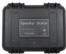
Transmitter Box x 1