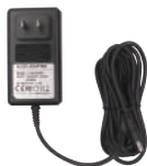
Power Cable x 1