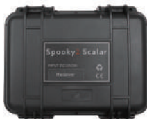
Receiver Box x 1