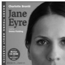
Jane Eyre (Brontë)