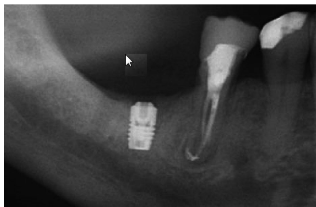
FIGURE 1 Part of rotational panoramic radiograph with 6-mm implant in position 46, 2 weeks after implant placement