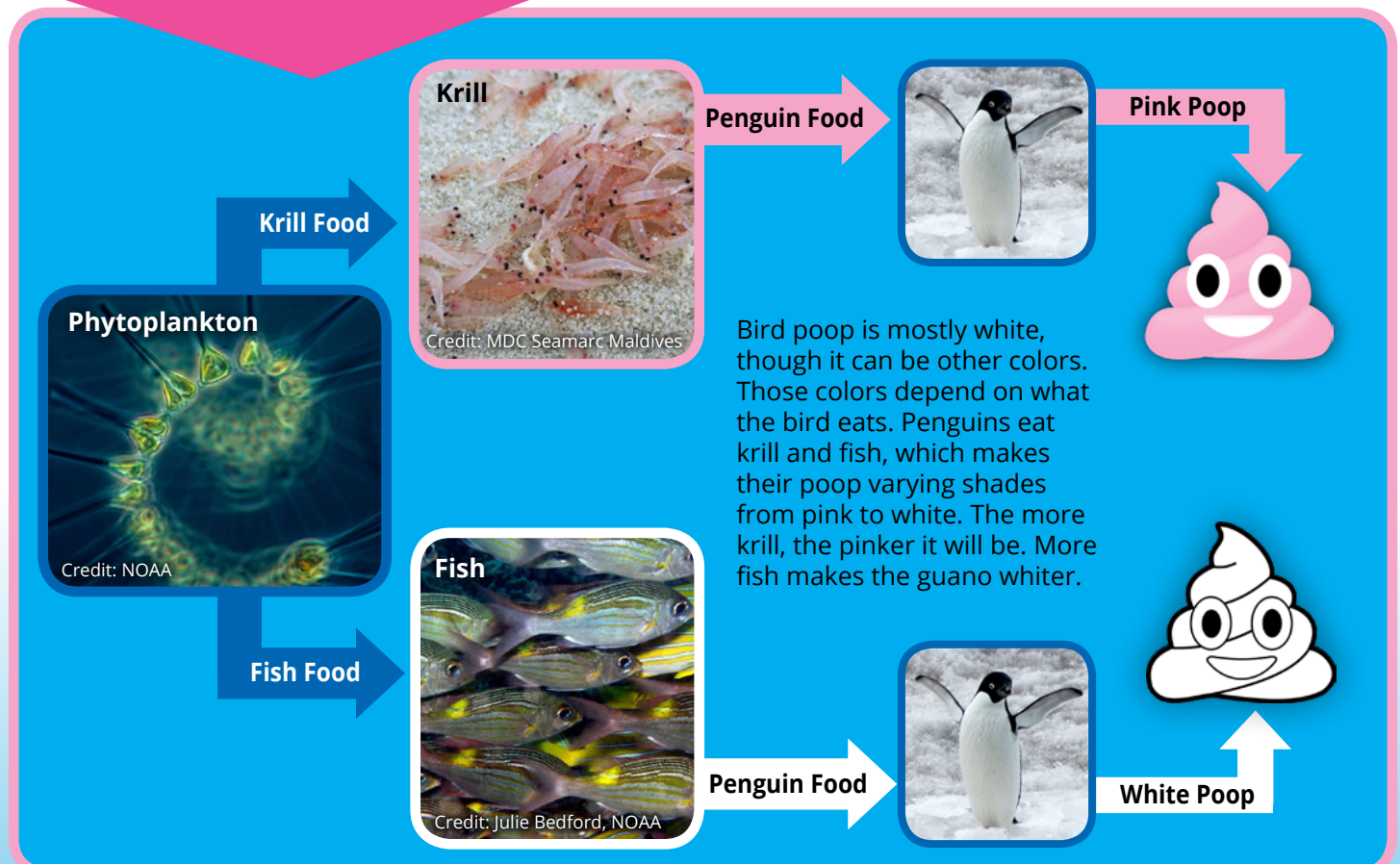
Adélie penguins are the smallest penguins in Antarctica.