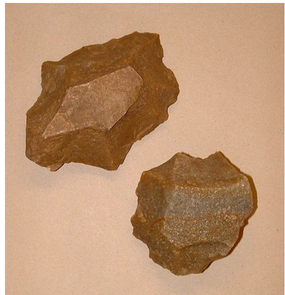
These prehistoric shells (left) and scrapers (above) are examples of artifacts preserved at the San Diego Archaeological Center that may be studied by researchers.