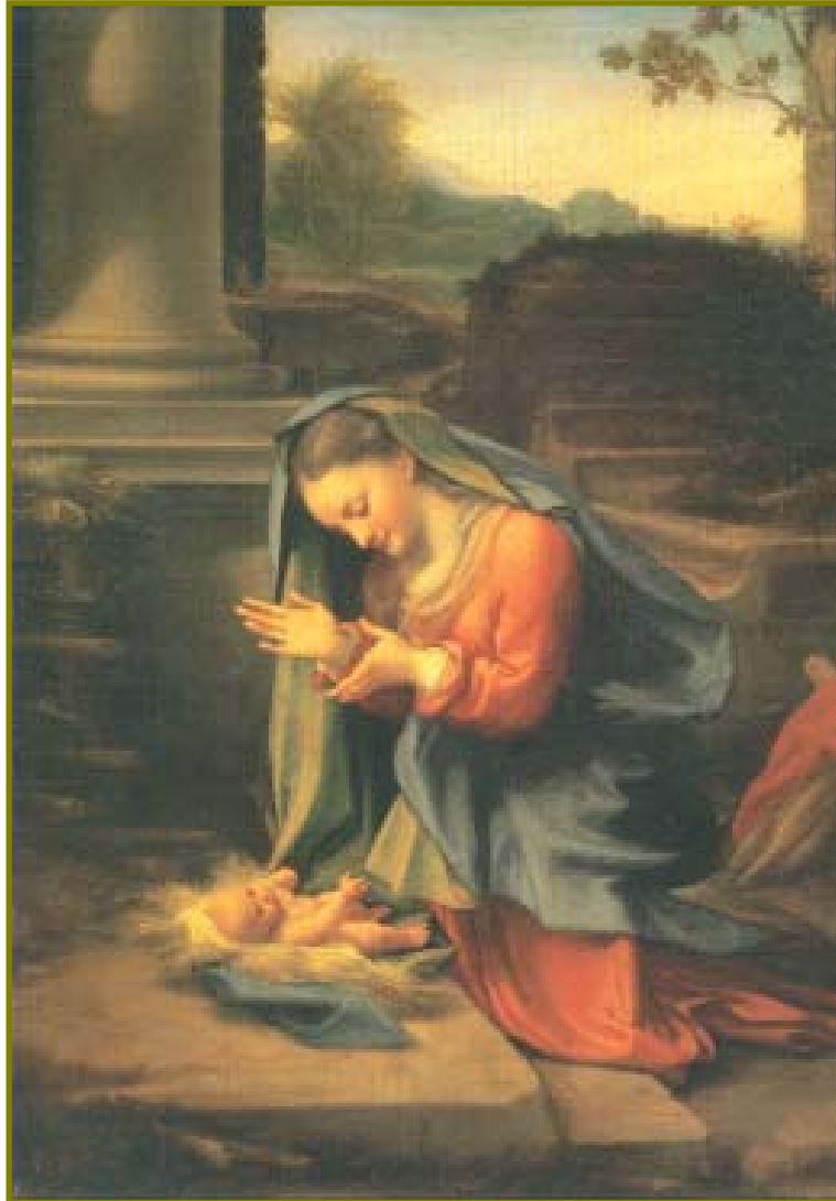
By Antonio Allegri