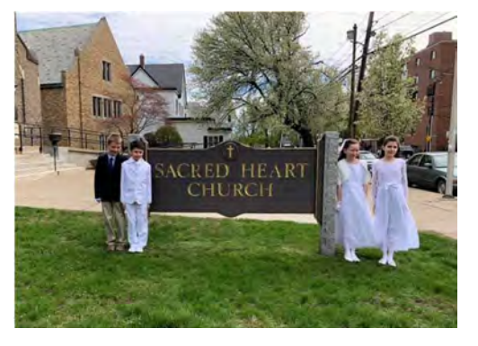
Sunday, April 28, 2019 10:15 Mass – Sacred Heart

These past weekends were a wonderful time for our Collaborative as 24 children made their First Holy Communion. Please keep the children and their families in your prayers as the blessings of our risen Lord continue to guide them all through their lives. Many thanks to all our catechists in the Faith Formation Program who helped prepare these children in their sacramental journey.