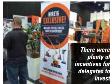
There were plenty of incentives for delegates to invest

articulated jib. The lift is also available without the jib as the 40ft 400S. Features include a new tri-entry removable platform with the Snorkel Guard secondary guarding system as standard.