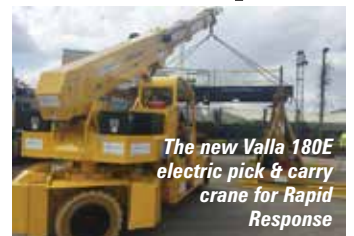
The new Valla 180E electric pick & carry crane for Rapid Response

The new cranes - a 12 tonne 120E and 18 tonne 180E - are battery powered and feature non-marking tyres and hydraulic luffing jibs.