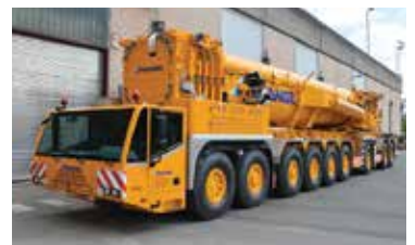
Prangl's new AC 1000 with 50 metre boom in place