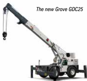
The new Grove GDC25

The first new crane in the GCD - Grove Carry Deck - series will be the 25 ton GCD25 with Cummins power, four wheel steer, four wheel drive and a 21.5 metre boom with optional 5.2 metre boom extension for a maximum tip height of 28 metres. A four-position pivoting boom nose enables the crane to work in low headroom applications. Further models in the new GDC series will be launched throughout 2016 and 2017.