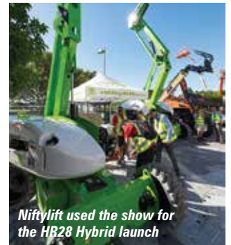
Niftylift used the show for the HR28 Hybrid launch