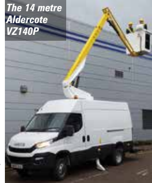
The 14 metre Aldercote VZ140P

Morclad director Tony Morris said: "The sweet spot for this machine is definitely street lighting as it is so quick and easy to set up. The performance is far better than our previous 14 metre van mount, particular the 250kg platform capacity."