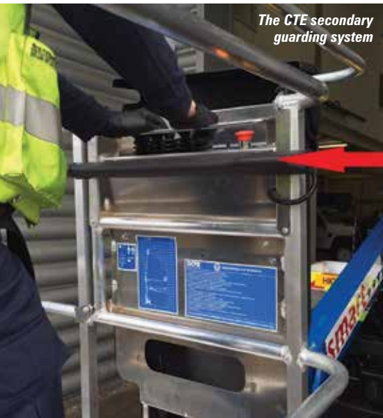
The CTE secondary guarding system

The device is similar to the many electronic systems on the market that use a rubber covered micro switch bar at the front of the control panel. When pressed it immediately stops all functions, sounds an alarm and sets off two red flashing beacons mounted on the underside of the platform. At that point the machine can only be operated from the emergency lower controls. Although the system can be reset from the platform by releasing the dead-man pedal and re-applying it.