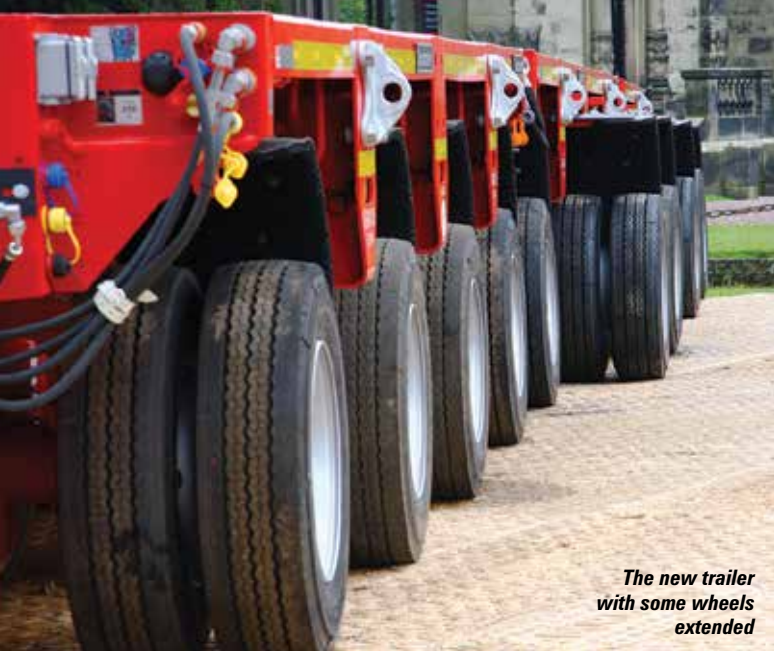
The new trailer with some wheels extended