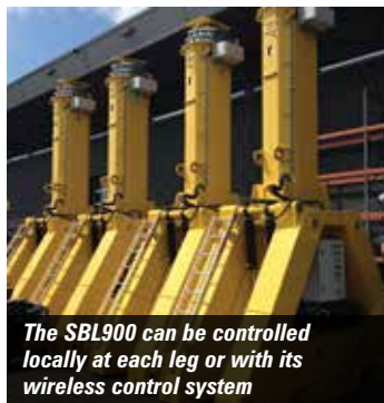
The SBL900 can be controlled locally at each leg or with its wireless control system

Heavy lift and jacking specialist Enerpac has unveiled its new 667 tonne SBL900 folding boom hydraulic gantry which features two stage lifting cylinders, an octagonal boom and mechanical locking, permitting load holding for extended periods of time. Lifting loads up to 11.3 metres the SBL900 can be controlled locally at each leg, or synchronised within 25mm through its wireless control system.