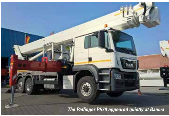
The Palfinger P570 appeared quietly at Bauma