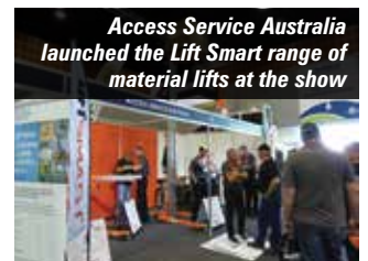
Access Service Australia launched the Lift Smart range of material lifts at the show

Genie service technicians renovated a 10 year old GS4390RT with a massive V8 Chevy hot rod engine and gold paint to celebrate Genie's 50th anniversary and promote its new 360 support and rebuild service.