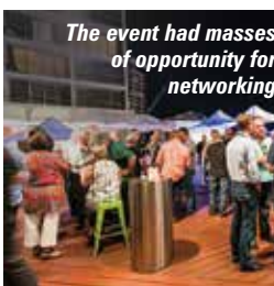
The event had masses of opportunity for networking

JLG won the overall 'Supplier of the Year' award and Alfasi Hire which mostly offers aerial lifts, telehandlers and cranes won the best rental company over $5 million award.