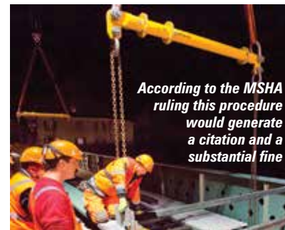
According to the MSHA ruling this procedure would generate a citation and a substantial fine

In spite of this the judge - using the dictionary definition of 'load' due to the fact that MSHA's own regulations do not define the term - has concluded that the spreader bar constitutes a load and stated that OSHA standards are not legally binding on the MSHA.