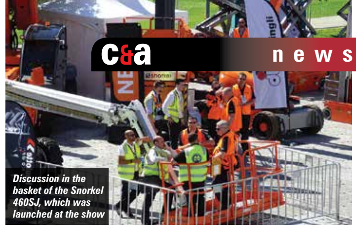
Discussion in the basket of the Snorkel 460SJ, which was launched at the show