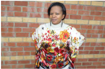
Mrs Memani leaves to take up an HOD post in East London