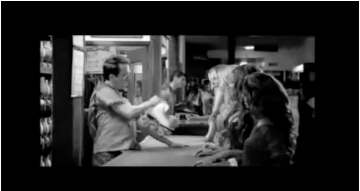
Fig. 3 Still from music video, “A Public Affair” 2006, Epic Records.