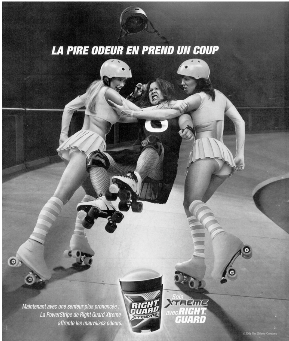
Fig. 1 Xtreme Right Guard Deodorant, International Print Campaign, 2006