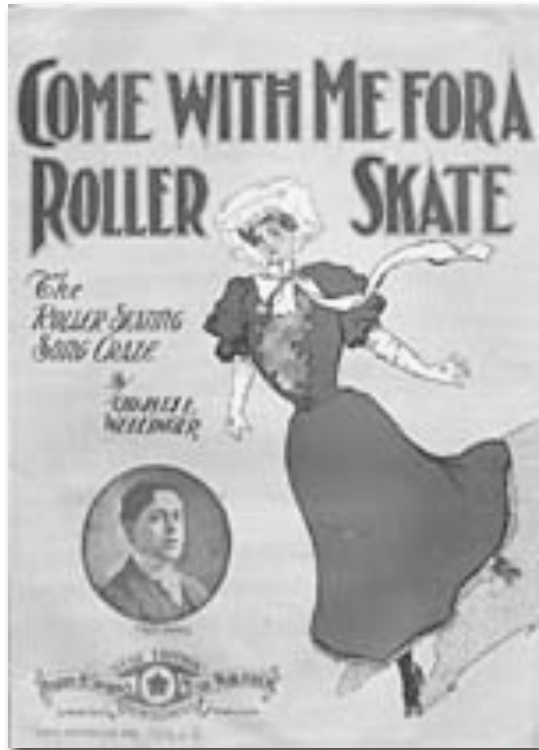
Fig. 5 The Roller Skating Song Craze music by Charles E. Wellinger, 1907.