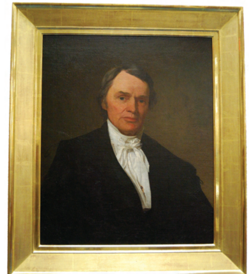
This restored portrait of Judge R.E.B. Baylor was unveiled at the Founders' Exhibition Opening Reception on Feb. 19 in the Allbritton Foyer of Moody Library. The painting is currently hanging in the Texas Collection at the Carroll Library.

Throughout the year, the Baptist 400 Celebration will recognize Baylor's heritage with conferences, lectures, exhibits and performances.