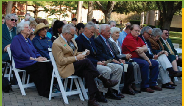
Guests attend the Texas Historical Marker Dedication for the Texas Collection at the Carroll Library on Oct. 31. Two markers were erected commemorating both the Carroll Library building and the Texas Collection as a whole.