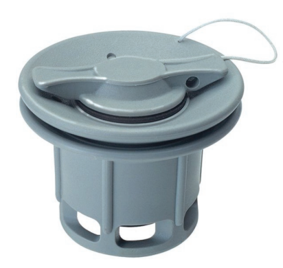
Using the Recessed Valve The RazorLites have one valve for each side chamber & one valve for the floor. Remove the cap to access the valve stem.