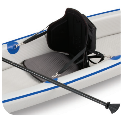
Tall Back Seat

Slide clips onto the strap. Insert free end up through the center of the buckle and down through the front slot making a foot long loop. Slide the tube onto the strap. Clip to the D-rings. Adjust for comfort. Trim excess with a scissor. Melt edge to keep it from fraying.