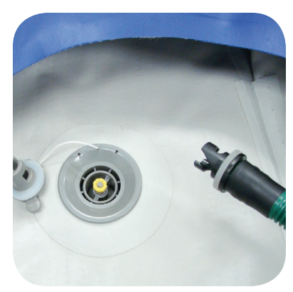
The correct adapter for the valves is pre-installed in the hose.