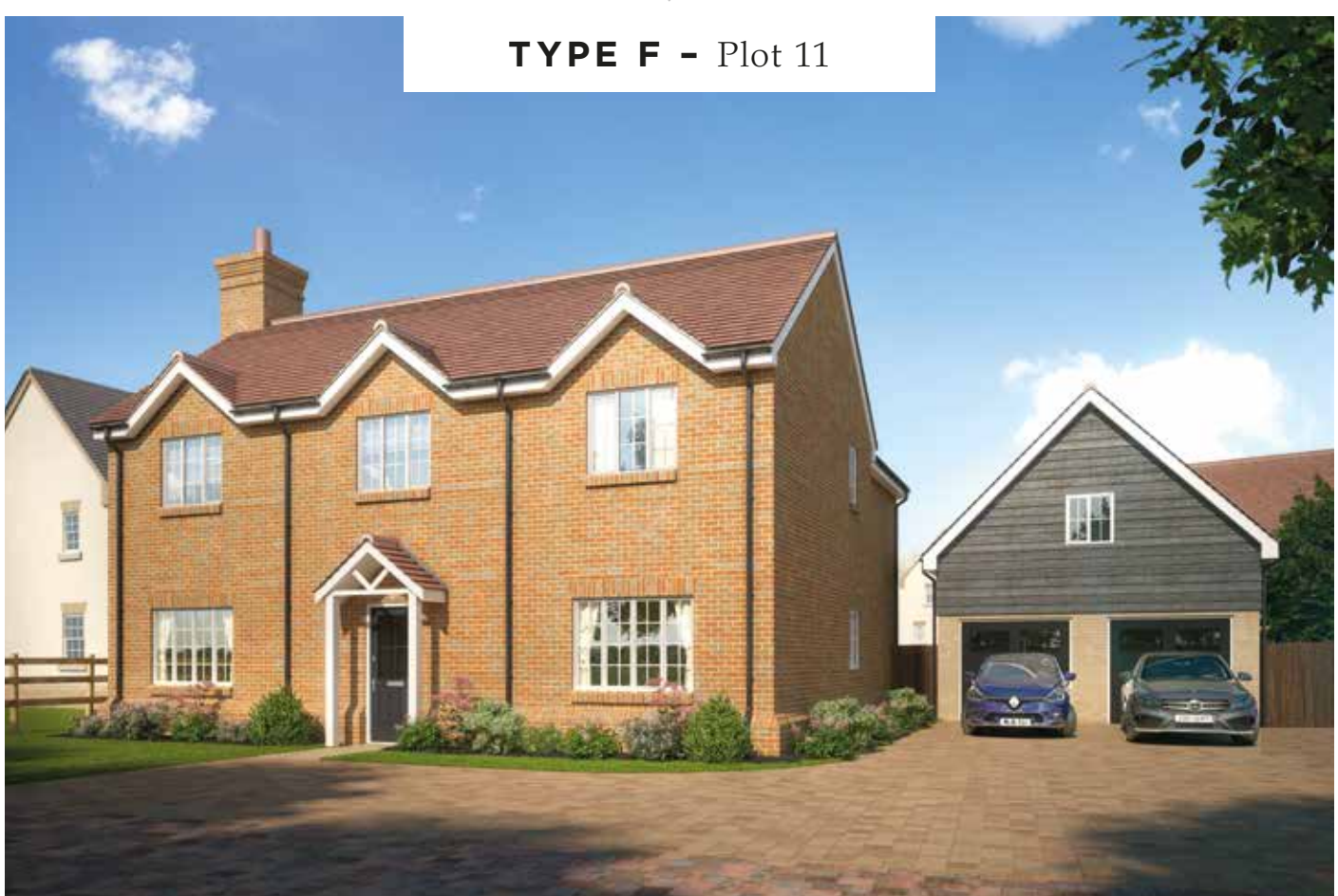
Computer generated image of Plot 11.

This unique home offers its own double garage and access to the back garden through French doors in the living room.