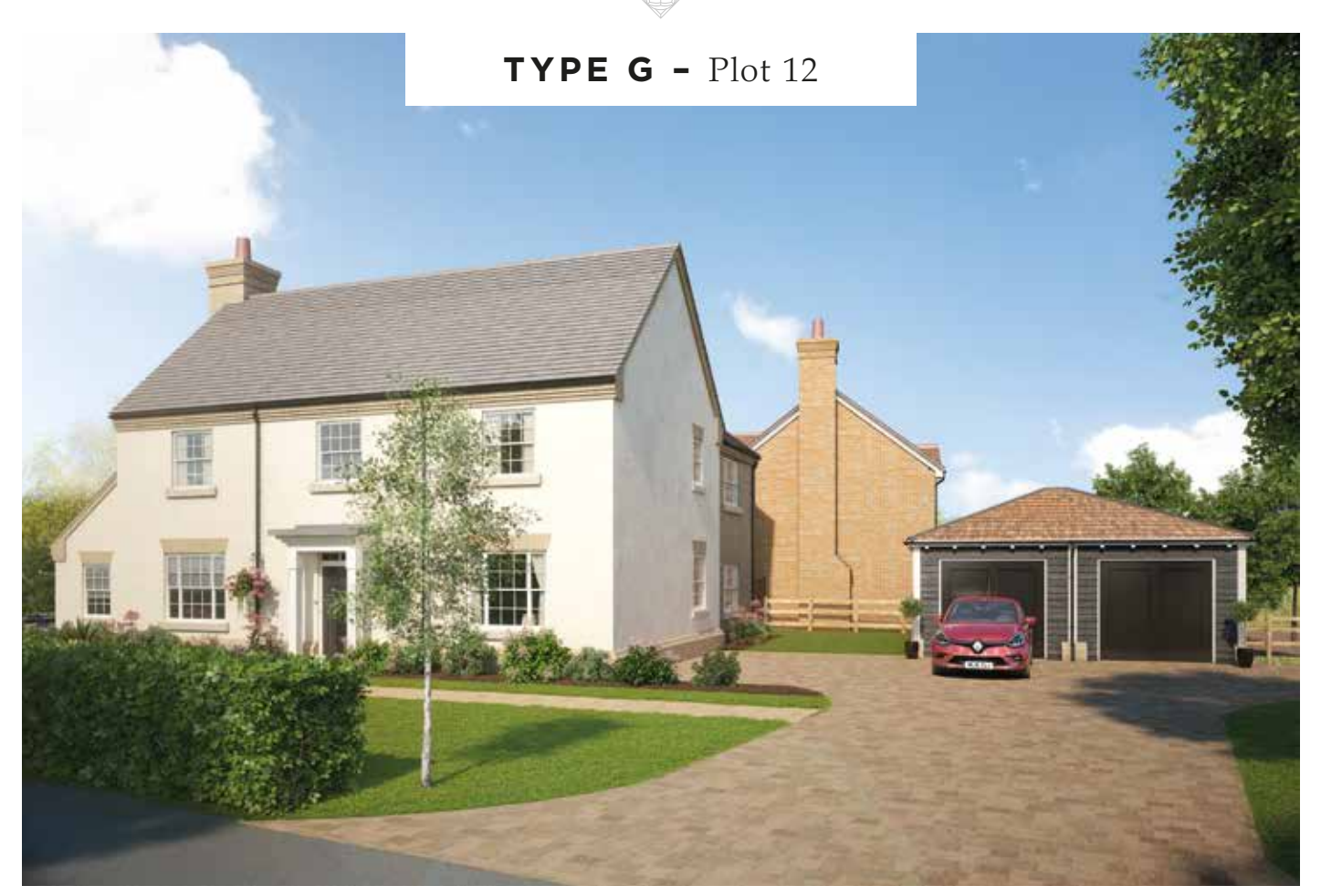
Computer generated image of Plot 12.

A five bedroom home, boasting two en-suites, and an impressive kitchen/dining room and living space.