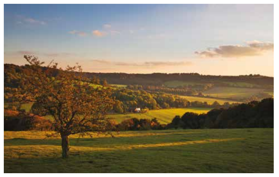
Photography of Chiltern.