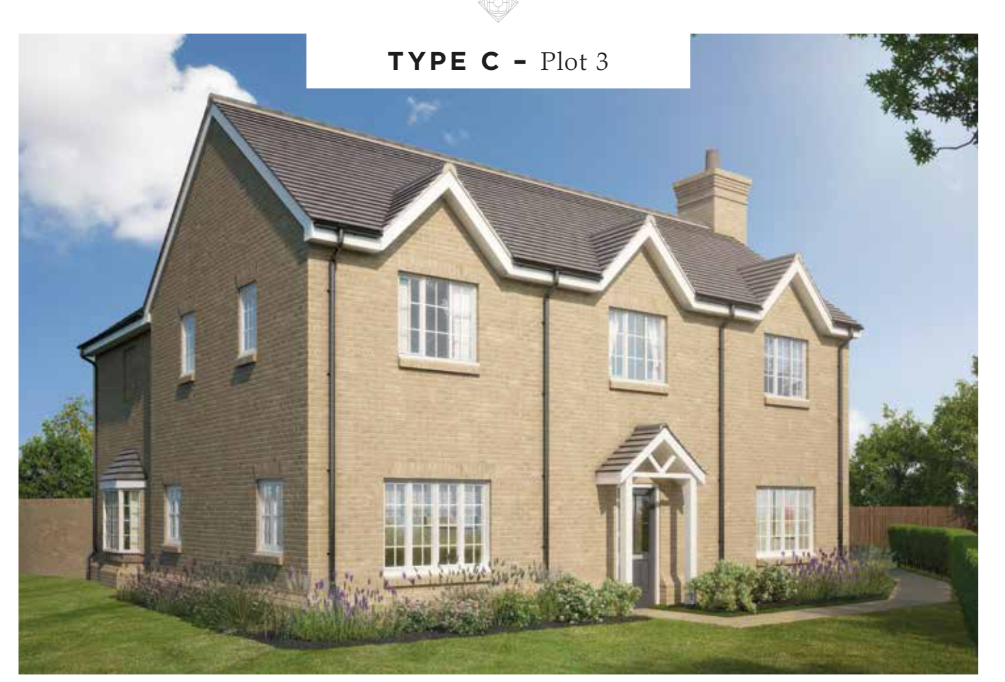
Computer generated image of Plot 3.

A luxurious home, with five spacious bedrooms and an enviable kitchen/dining room.