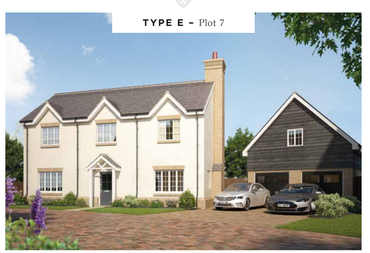
Computer generated image of Plot 7.

A luxurious home, with five spacious bedrooms and an enviable kitchen/ dining room.