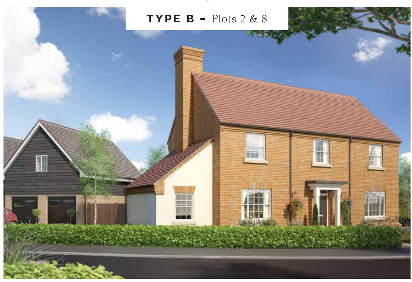
Computer generated image of Plot 2. Please note Plot 8 is handed.

A five bedroom home with two separate living spaces and an extensive kitchen/dining room.