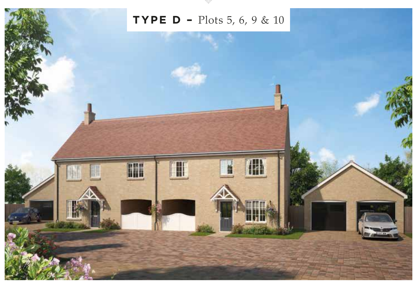
Computer generated image of Plots 5 & 6.

A four bedroom home with an integrated kitchen/dining area and spacious living room.