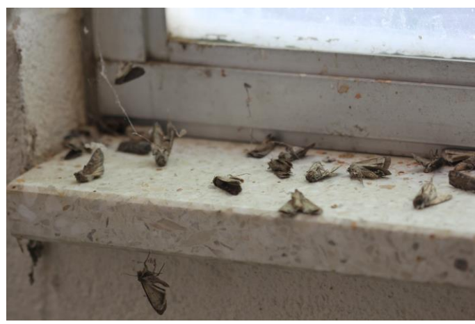
Aggregations of dead miller moths collect around windows and behind walls.

When large numbers die in a home there may be a small odor problem (due to the fat in their bodies turning rancid). Also, unless they are cleaned out, old moths may serve as food for carpet beetles and other household scavengers. These secondary insects may become problems in subsequent years.