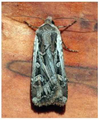
Three army cutworms ("miller moths") showing range of patterning.