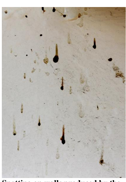
Spotting on walls produced by the meconium of army cutworm moths.

In addition, miller moths are able to produce and excrete fluid for most of their adult life (a process known as "rectal