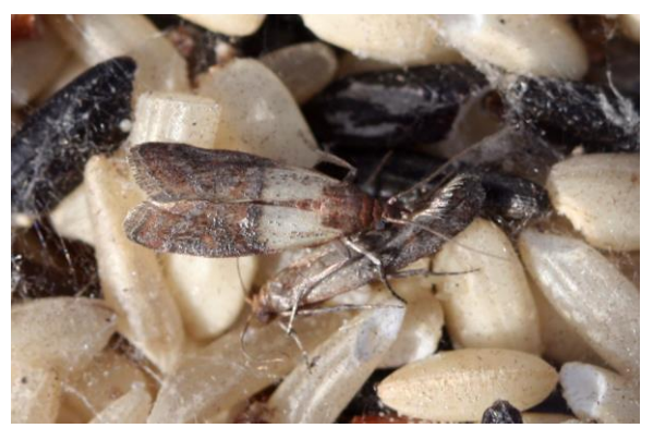
Indian meal moths

Although the army cutworm moth usually is the most common moth in eastern Colorado homes during the time of spring migrations, other moths are more common during other times of year. The Indianmeal moth is the most important moth found in homes since its caterpillar stage can be a serious pest of pantry items such as nuts, dried fruit, grains, pet foods, and seeds.