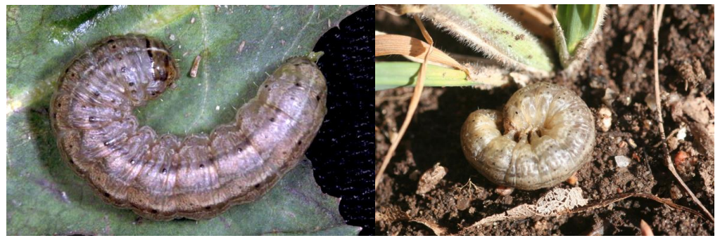
(Above) Late stage larvae of the army cutworm. (Below) Pupa of the army cutworm