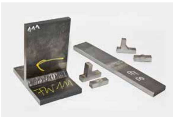
Fillet weld and V-weld test pieces