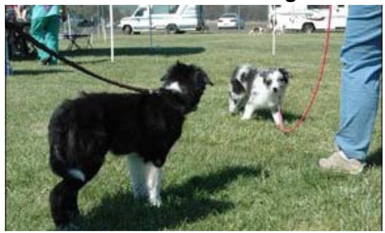
Proper leash greeting: while the Aussie appears nervous the loose leash allows him to approach on his own accord.

It's always best to have a plan when introducing a new dog to your household. This could be your new dog or puppy you are introducing to the family, a friend or family coming to visit for the weekend, or a dinner guest bringing their dog along.