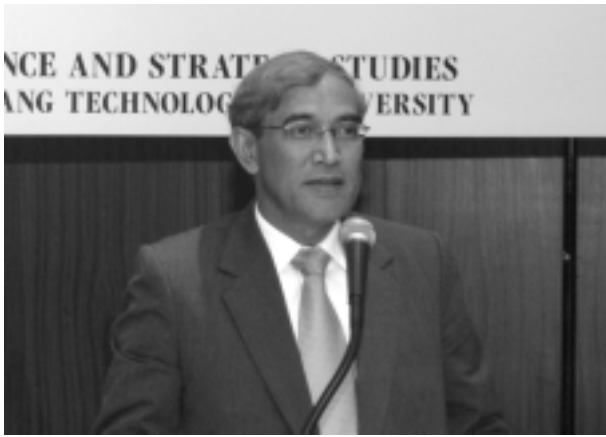
Guest-of-Honour Mr. Zainul Abidin Rasheed, Minister of State for Foreign Affairs, gave the keynote speech, in which he emphasized the progressive dimensions of Islamic revivalism

addressed by this conference. For one, there is an urgent need to counter negative stereotypes of Islam and of Muslims that have flourished since 9/11. A second important point, Mr. Abidin noted, is the call to re-imagine Islam as a civilizational project that carries a cultural heritage of both progress and reform.