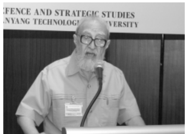
Professor Syed Hussein Alatas speaks on “The Meaning of Progressive Islam”

While it is true that a deeper appreciation for the Islamic point of view has been developing in the West, the Western media has been slow to catch up. Professor Alatas gave as example the labels used by numerous experts and journalists, such