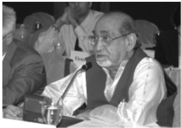
Professor Asghar Ali Engineer speaks on "Progressive Islam, Islamic State, and Rethinking Shari'ah Laws"

Professor Engineer classified the Qur'anic verses into two categories, contextual and normative. In his opinion, the four values mentioned above belong to the normative realm. When converted to laws, they require stipulations that reflect them as closely as possible, while also taking into account the complexities of real life. This is precisely what Islamic jurists in the early centuries of Islam did. The laws they formulated were attempts to approach the Qur'anic ideals in any given situation, but from the perspective of the social realities of the time. As such, no