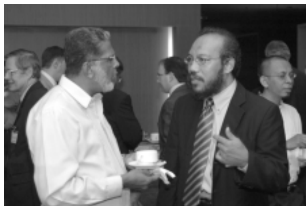
Tea breaks were an opportunity to carry the discussion outside the forum