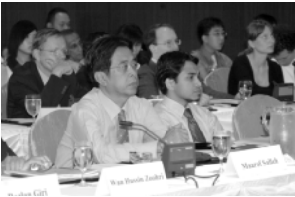
Conference participants were able to share their views and exchange perspectives during the Q & A sessions

development in the quest for an Islamic state since it instituted Islam as a key dimension of state policy.