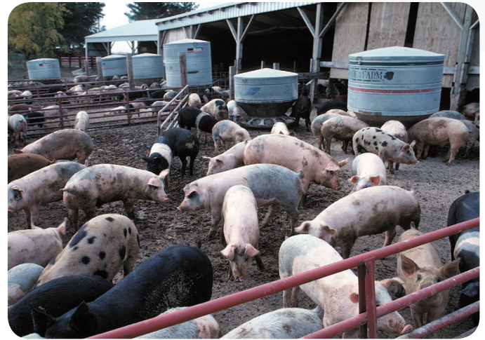
Lynn Betts, NRCS

In swine diets a variety of feedstuffs such as corn, barley, milo, or oats are used to provide energy, while oilseed meals (primarily soybean meal) are the major source of protein. Vitamins and minerals are also added to the feed to optimize health and growth at each stage of life. The ration is normally changed to provide more energy and less protein as the pig grows. Pig rations are usually ground or partially ground prior to mixing.