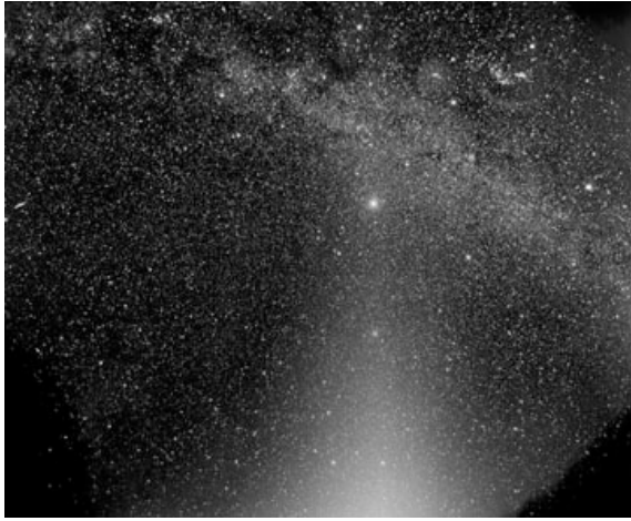
Fig. 4. The zodiacal light rises from the horizon, envelops planets along the ecliptic, and intersects the Milky Way

In Exploring Ancient Skies: An Encyclopedic Survey of Archeoastronomy , we find a reference to the zodiacal light: