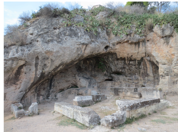
Fig. 2. Semi-spherical cave of Hades, portal to the afterlife, at Eleusis today, about 18 kilometers outside Athens.

We should bear in mind that in the Myth of Er, Plato describes both celestial (Fig. 1) and infernal (Fig. 2) gates ( Republic , Book X, 614c; LCL, 276).