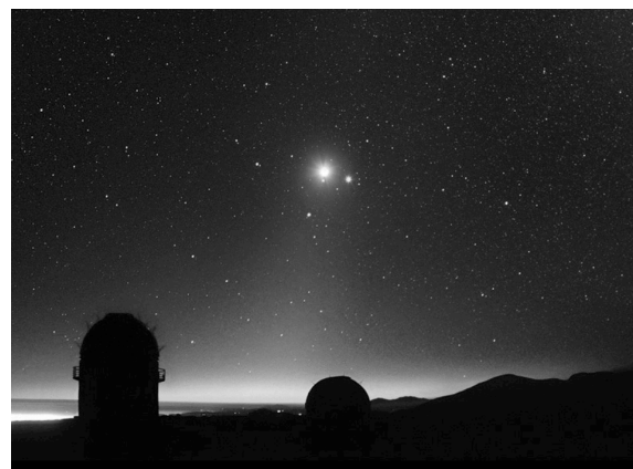
Fig. 5. Zodiacal light rises from the horizon and envelops the crescent Moon and planets, at Skinakas Observatory, Crete, October 7, 2007.

The zodiacal light can in fact be seen when the Moon is in the sky (Figure 5).