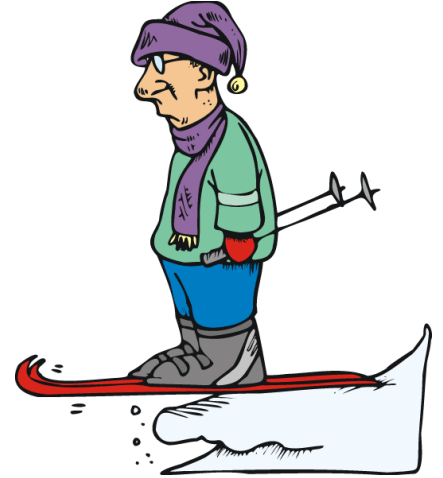
Stop shouting, Hannah! Otto sees the problem.

Use the clues for each of the following items to fill in the missing letters and reveal the identity of the single-word palindrome. If you get momentarily stuck, remember that the word's first letter is also its last letter. The second letter is the same as the next-to-last, etc.