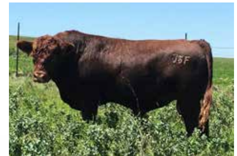
Yearling photo of JSF Red Rocket 89C after breeding cows for 30 days.