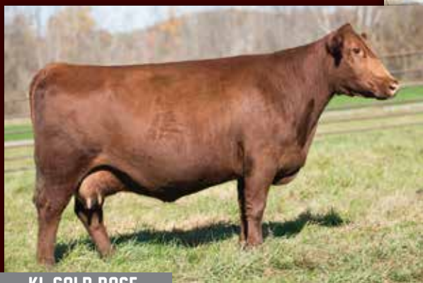
KL GOLD ROSE