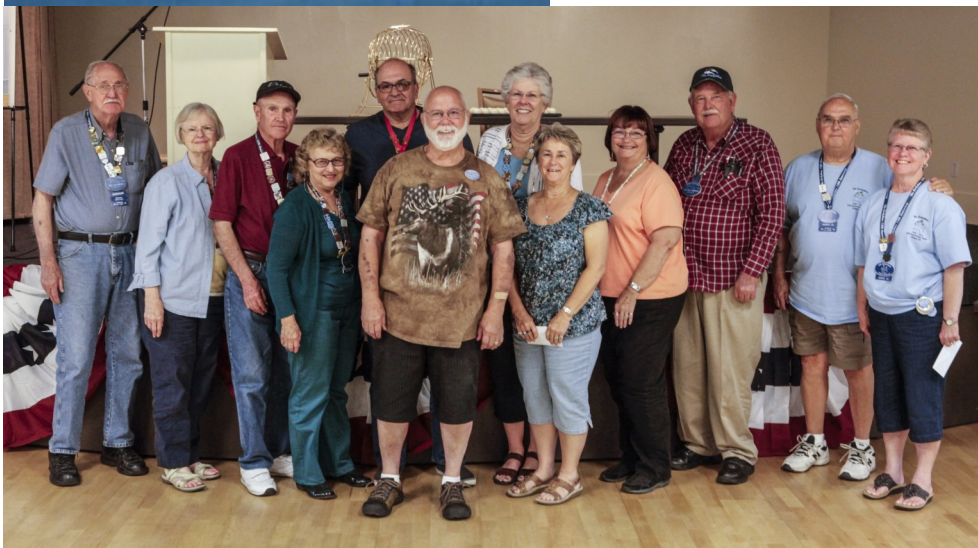
Shuffle Board Winners