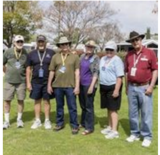
Ladder Golf Winners