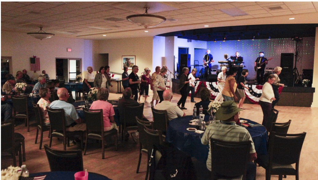
Performing Saturday Night For Entertainment was “The Calico Ridge”

There was a lot of line dancing going on.