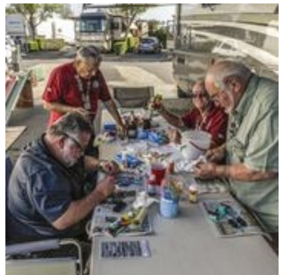
Model Race Car Building and Painting