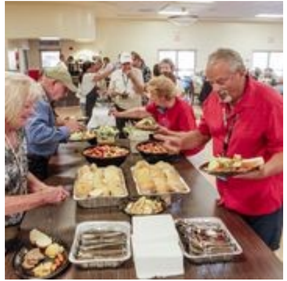
Biscuits and gravy For breakfast