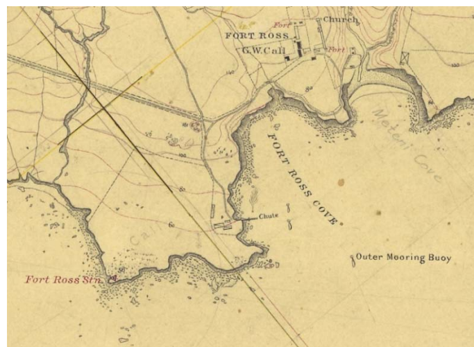
Figure 2. Fort Ross Cove, chute, settlement and indigenous place names T-Sheet T01457 (NOAA Library)

One submerged historic property, SS Pomona , was listed on the National Register of Historic Places in 2008; the shipwreck is located in Fort Ross Cove, Sonoma County, and partly in a California State Park. The steamship Pomona was built in 1888 by the Union Iron Works in San Francisco for the Oregon Improvement Company. The passenger-cargo steamer was a single-propeller, steel-hulled vessel that traveled between San Francisco and Vancouver, British Columbia making stops at ports in between. On March 17, 1908, the SS Pomona was transiting northward on a routine voyage encountering heavy seas, when it struck a reef off Fort Ross. Captain Swansen, Pomona's master, tried to save the vessel by running it aground in Fort Ross cove, but impacted a wash rock inside the cove and sank. Over the subsequent months, salvage efforts were conducted on the ship, and eventually it was dynamited as a navigational hazard. Today, the wreckage of SS Pomona lies in less than 50 feet of water in Fort Ross Cove ( Schwemmer 2017 ).