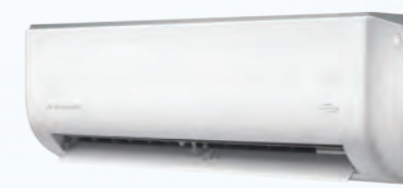
Serene wall hung split