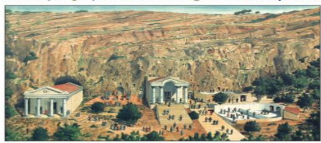
Artists' conception (above) of Caesarea Philippi, also called Paneas, during the Roman period. This pagan religious site was built into the cliff face with temples dedicated to Baal and many other delities. The site, (shown below) as it appears today.