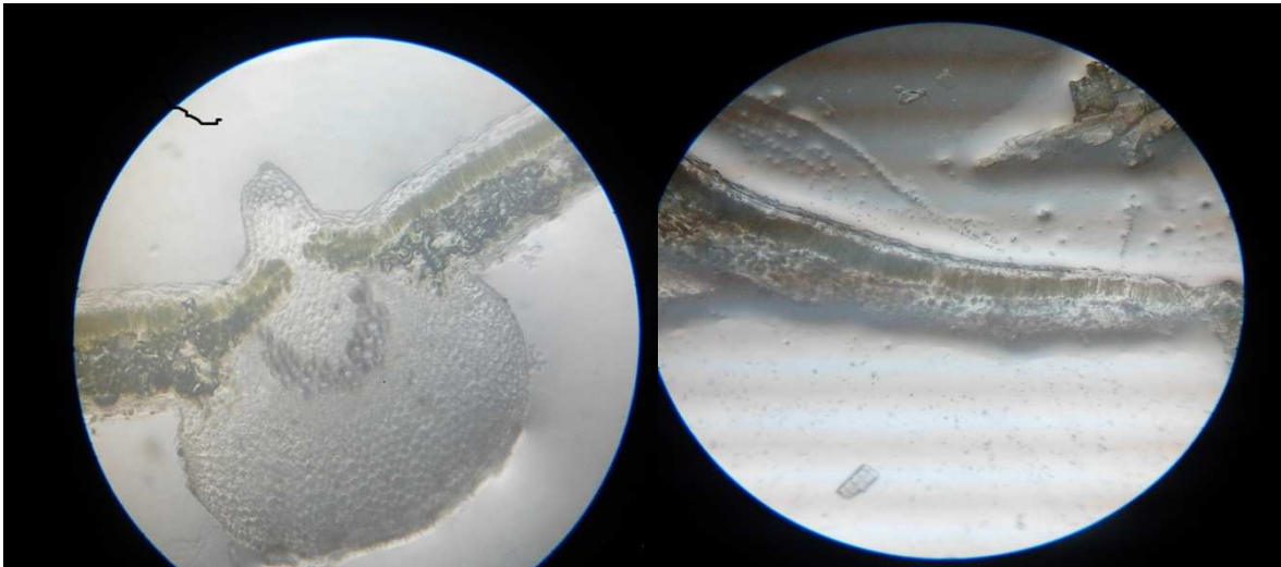
Figure 1. Transverse section of Jatropha gossypifolia L. (T.S)

Multi headed with central stalk glandular trichomes are seen in the lower epidermis on the mid rib portion