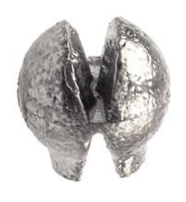
pinch the "ears" to remove