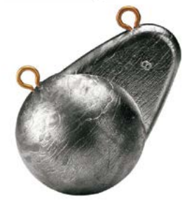
Special casting equipment. See page 96